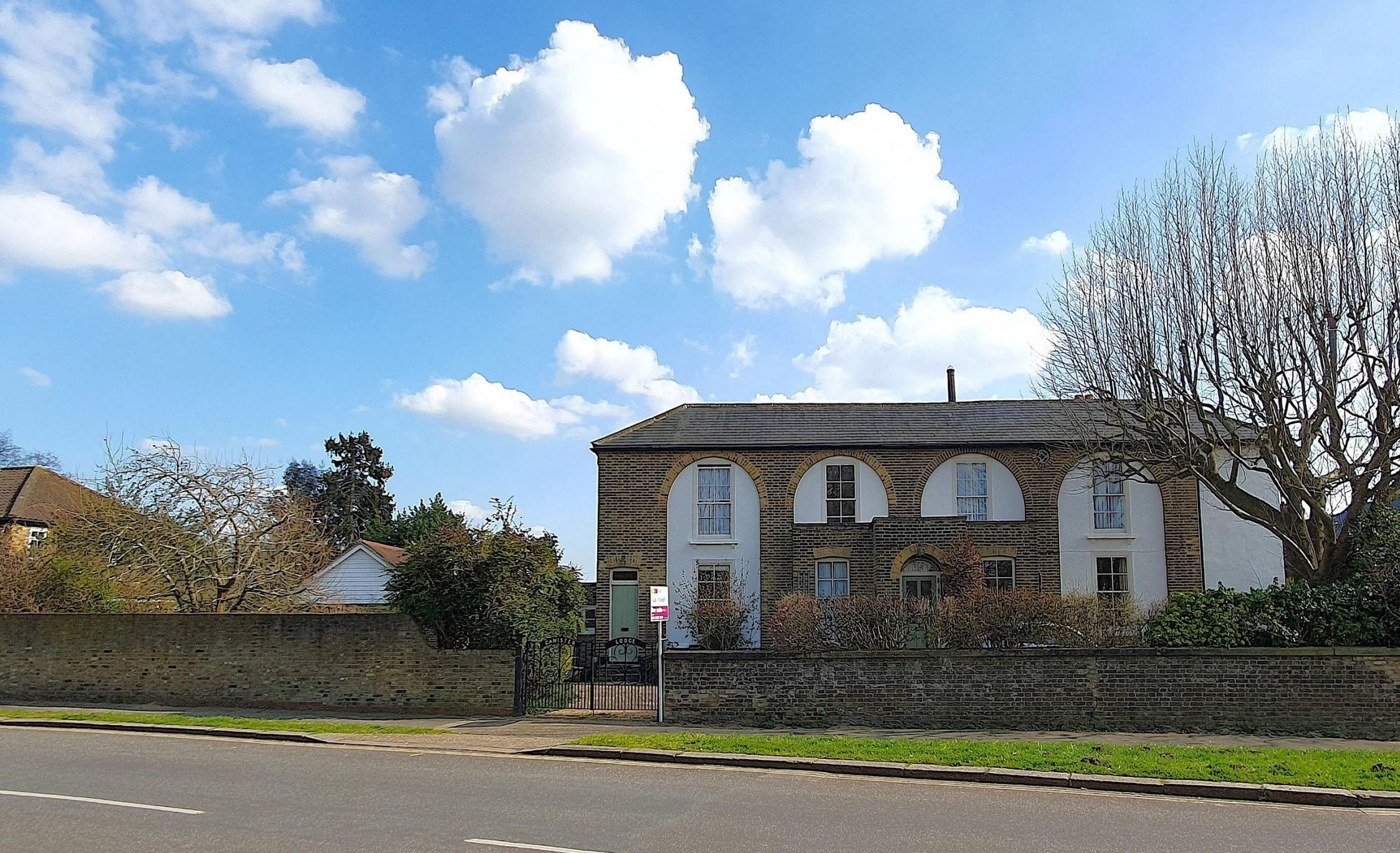
Canister Lodge, Forty Hill, Enfield, EN2 9EQ