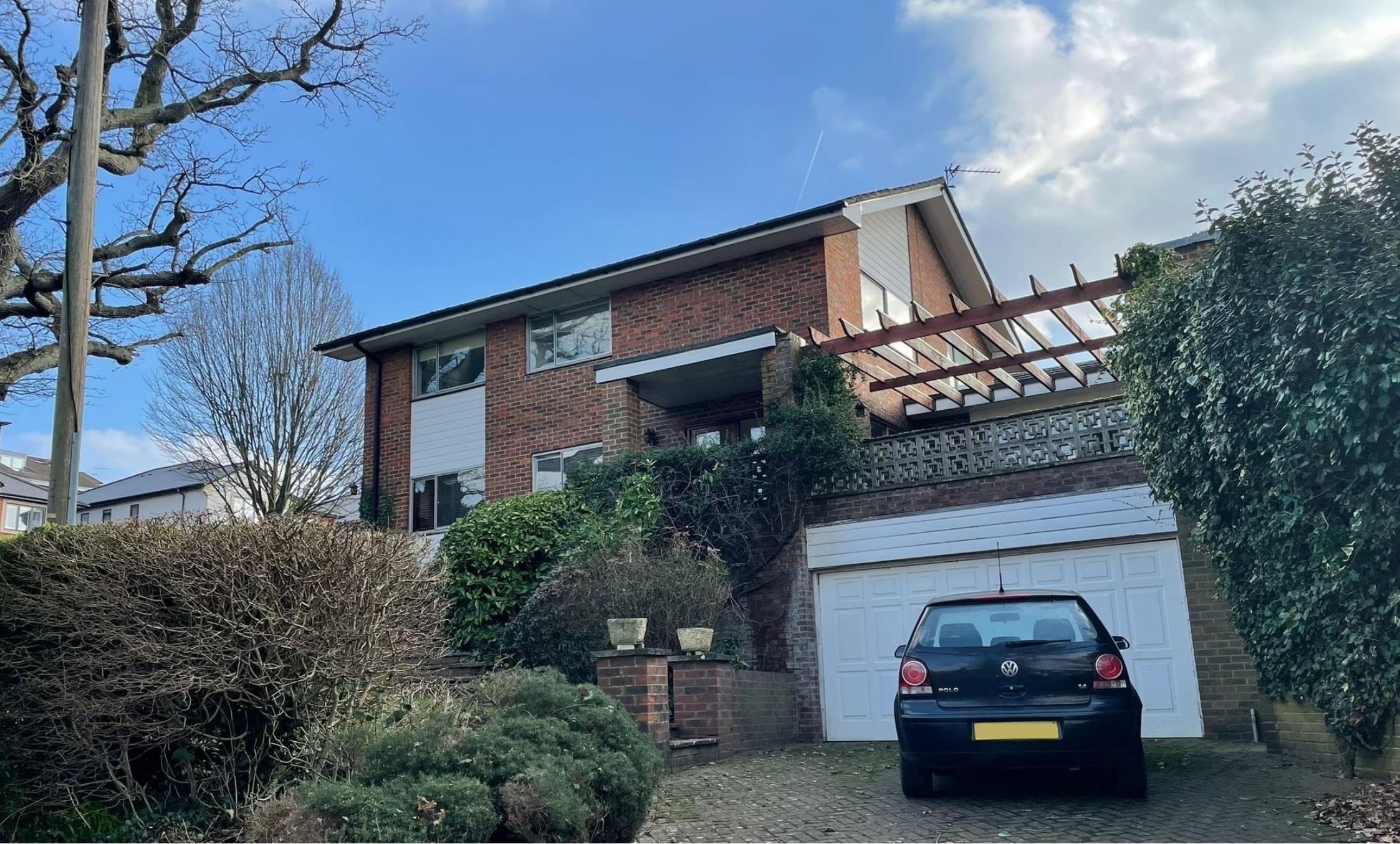
The Coppice, Enfield, EN2 7BY