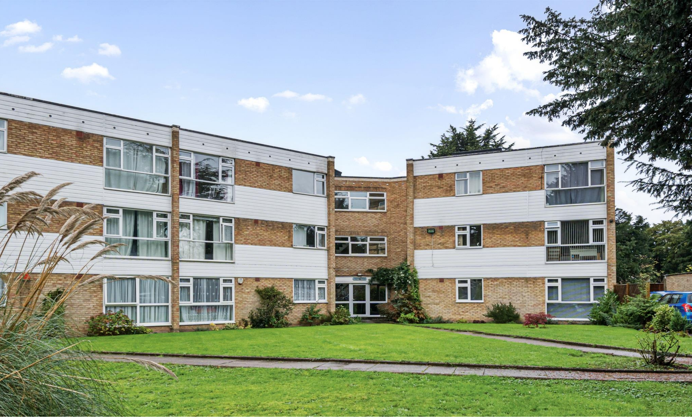
Wade House, Village Road, Enfield, EN1 2DL