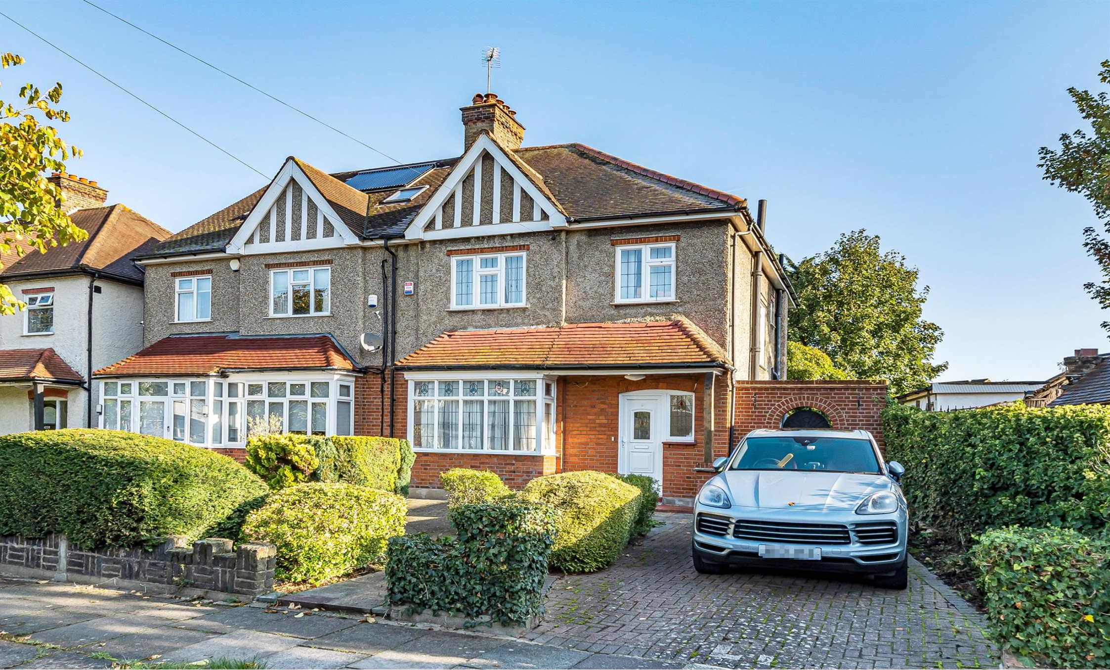
Park Crescent, Enfield, EN2 6HT