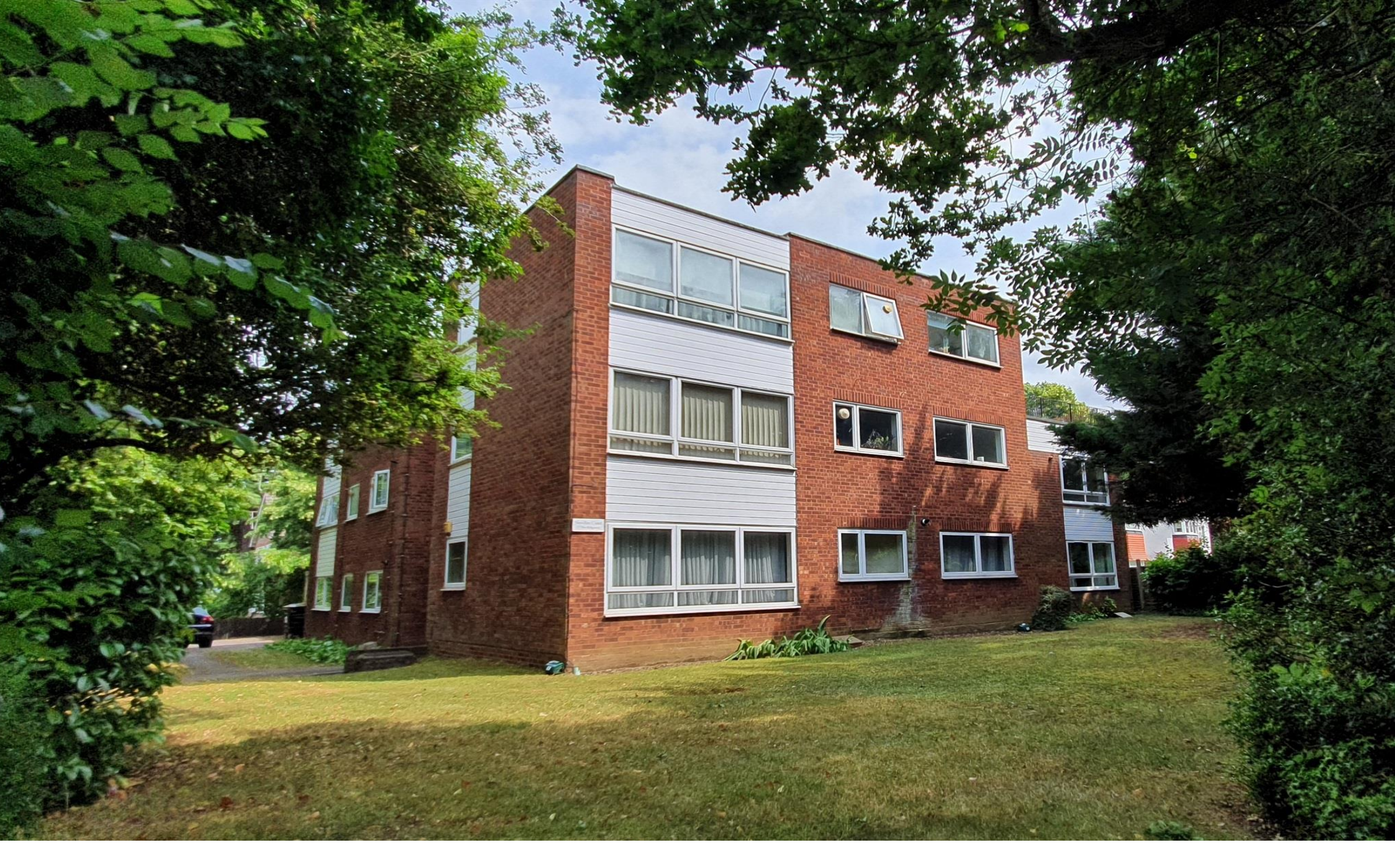
Nevilles Court, The Ridgeway, Enfield, EN2 8PQ