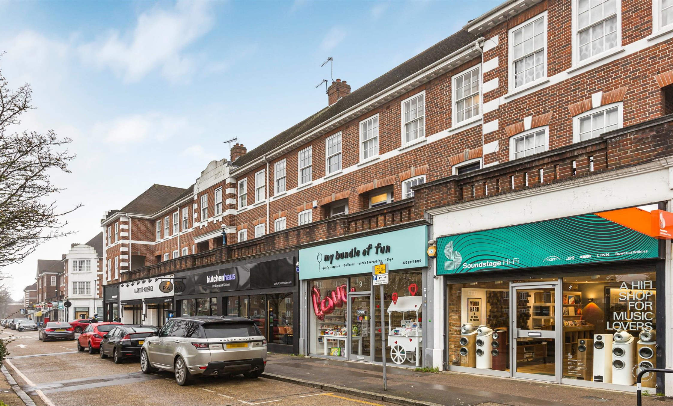
Heddon Court, Cockfosters Road, Barnet, EN4 0DE