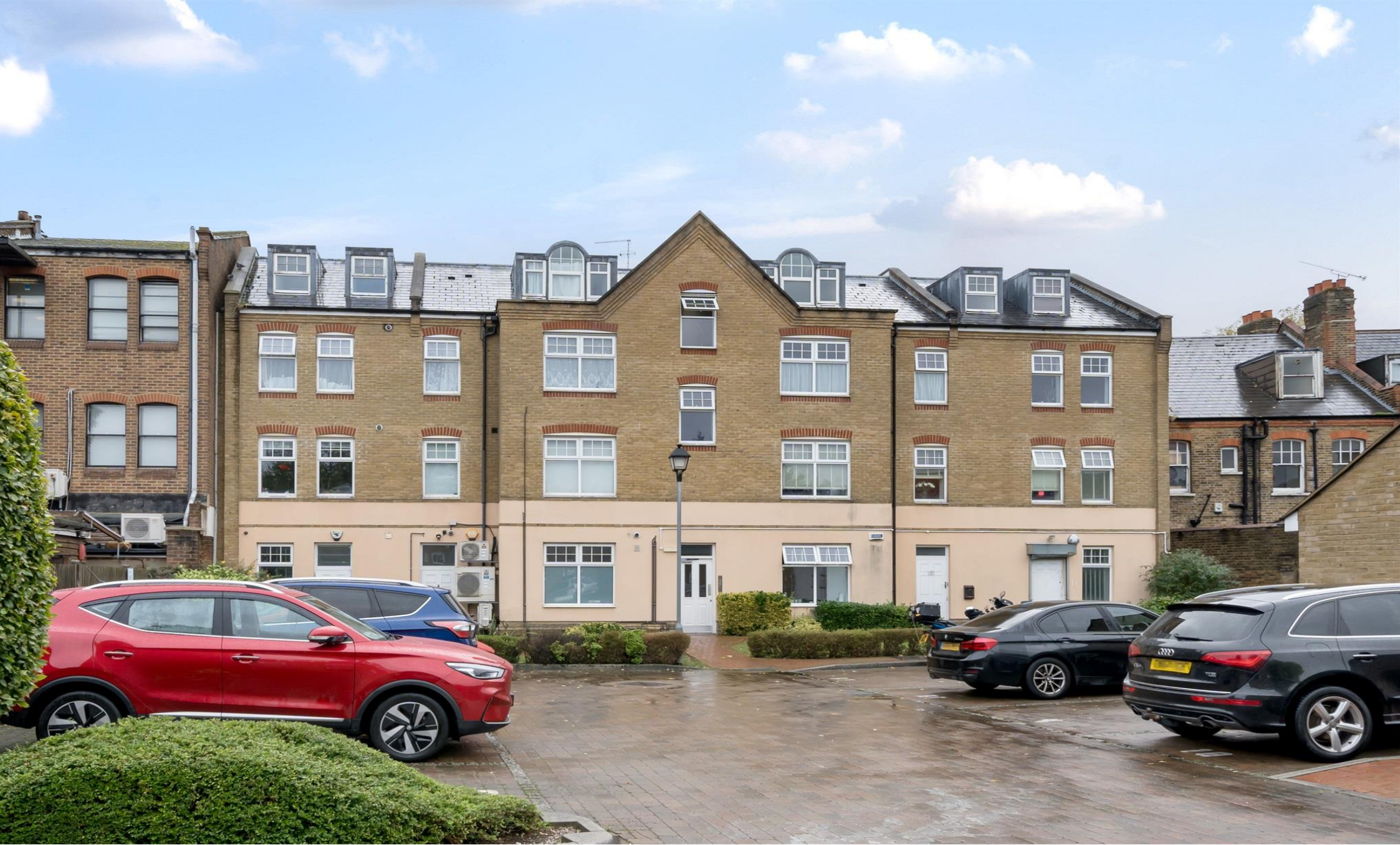
Buttery Mews, London, N14 7DF