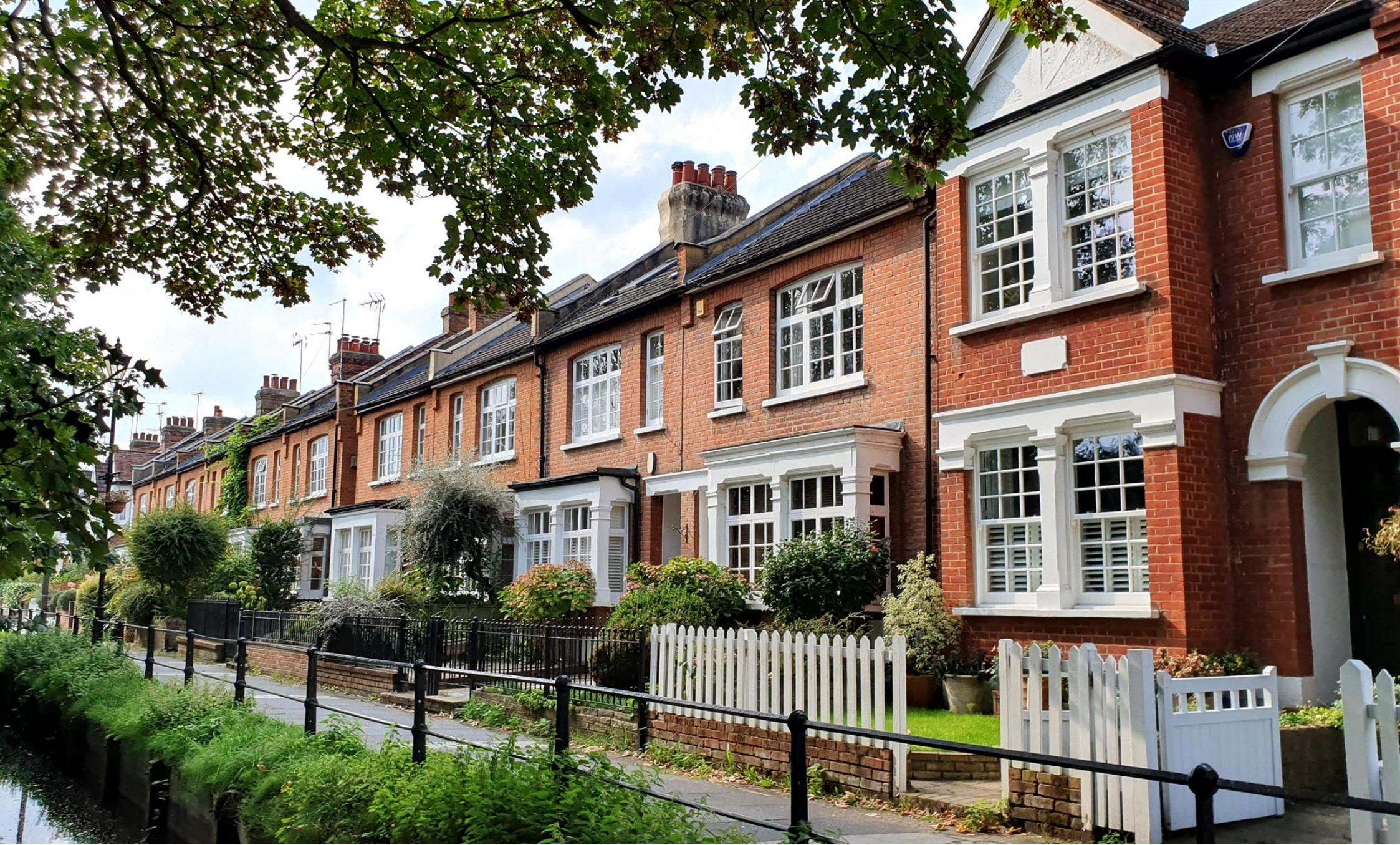
River View, Enfield, EN2 6PX