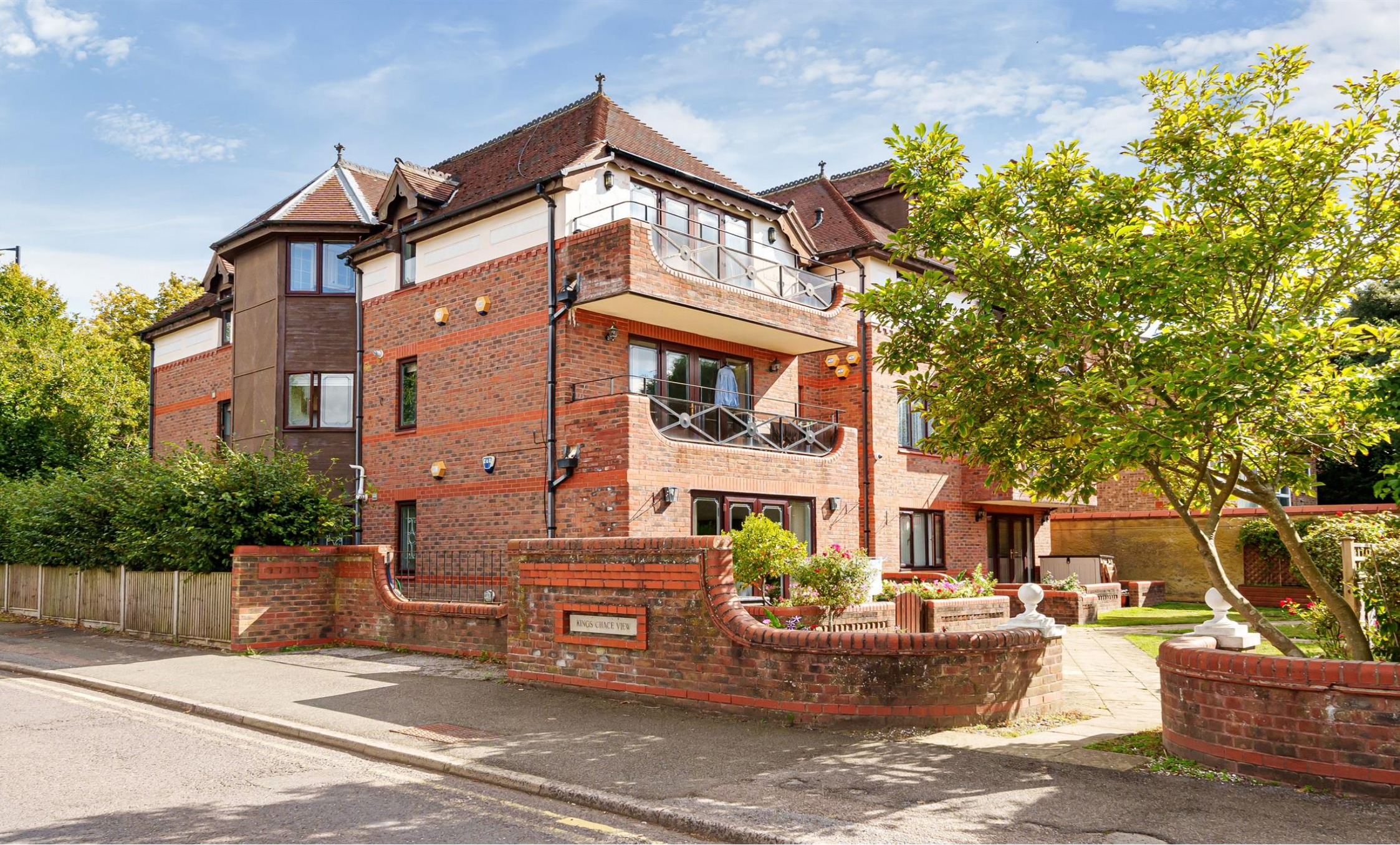
Kings Chase View, The Ridgeway, Enfield, EN2 8LG