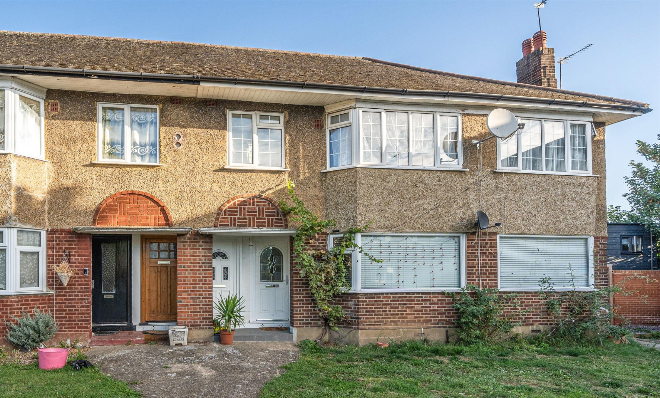
Beresford Gardens, Enfield, EN1 1NP