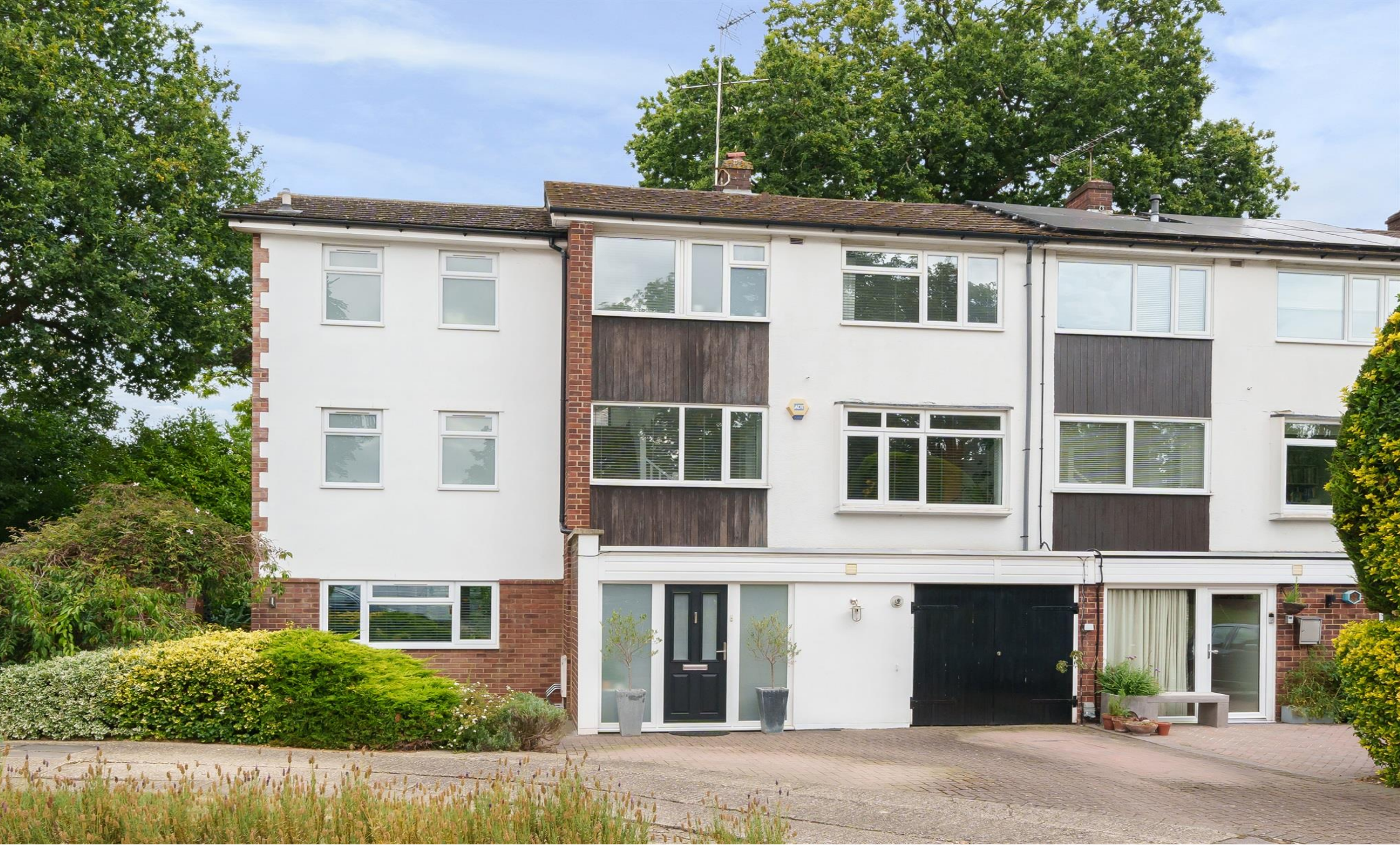
Forsyth Place, Enfield, EN1 2EP