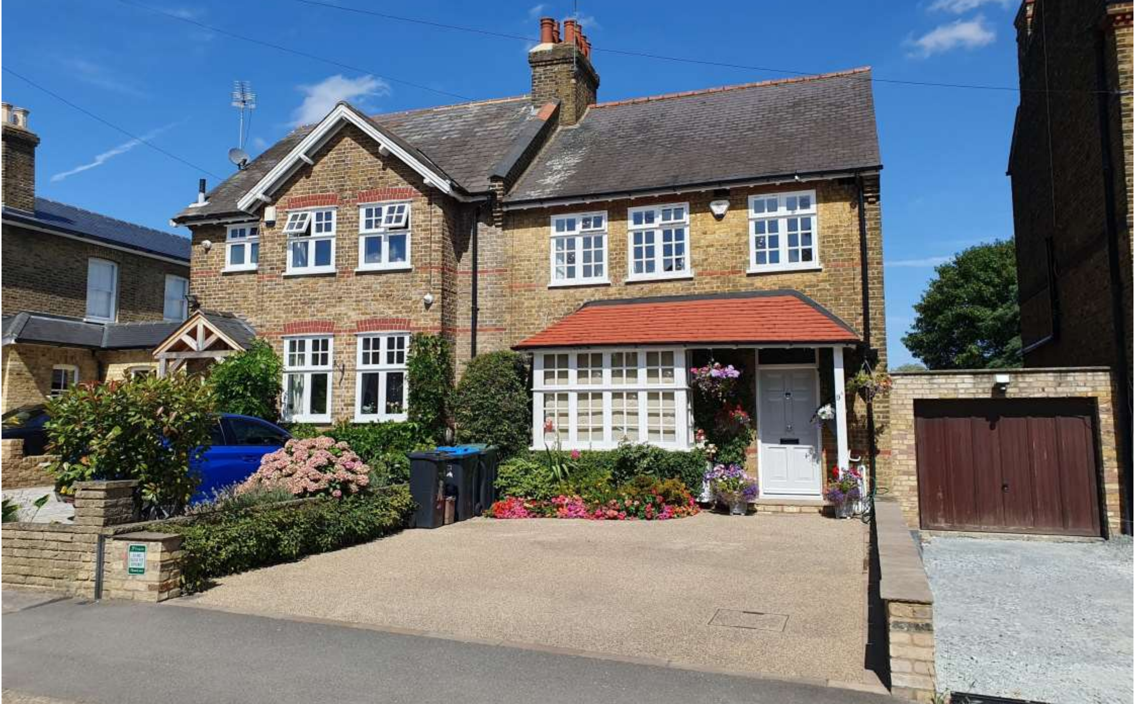
Gordon Hill, Enfield, EN2 0QP