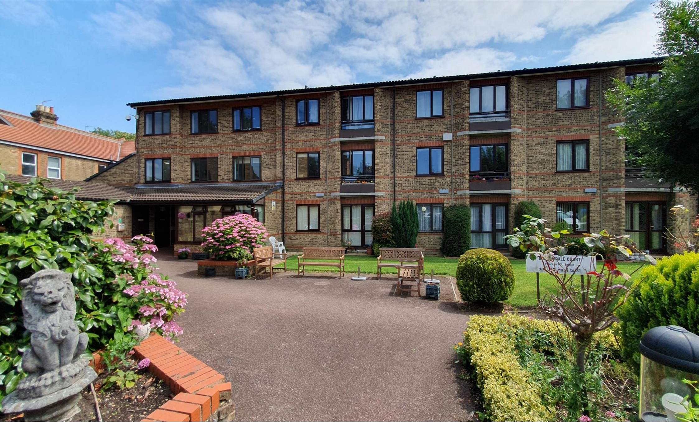
Borrowdale Court, Gordon Hill, Enfield, EN2 0QJ