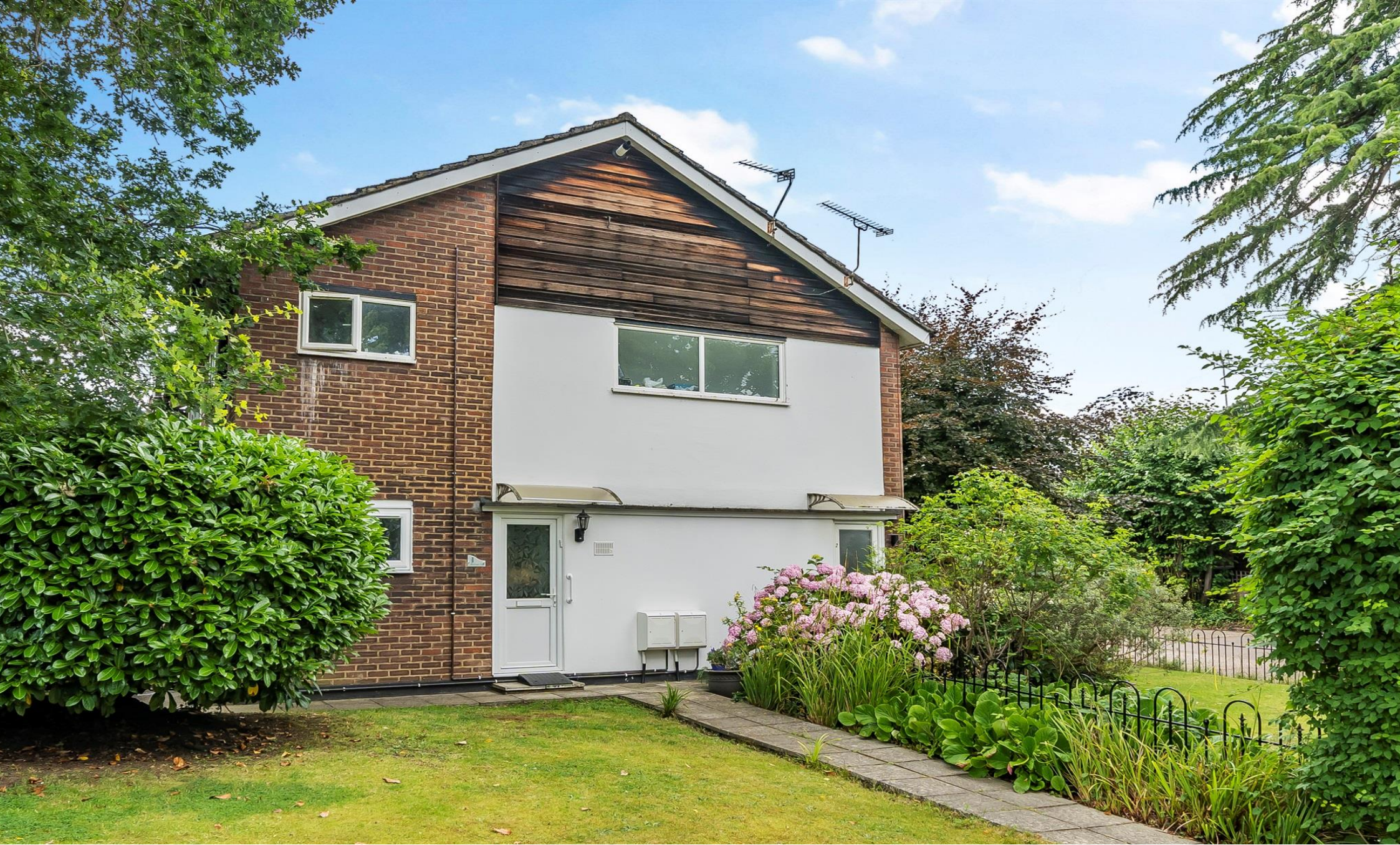
Hermitage Close, Enfield, EN2 8EL