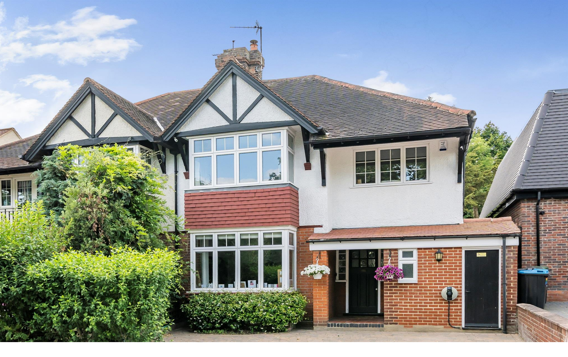
Old Park Avenue, Enfield, EN2 6PN