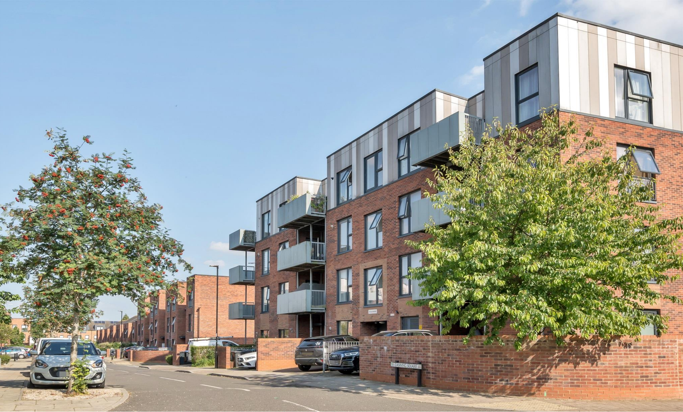
Potash House, Canning Square, Enfield, EN1 4BP