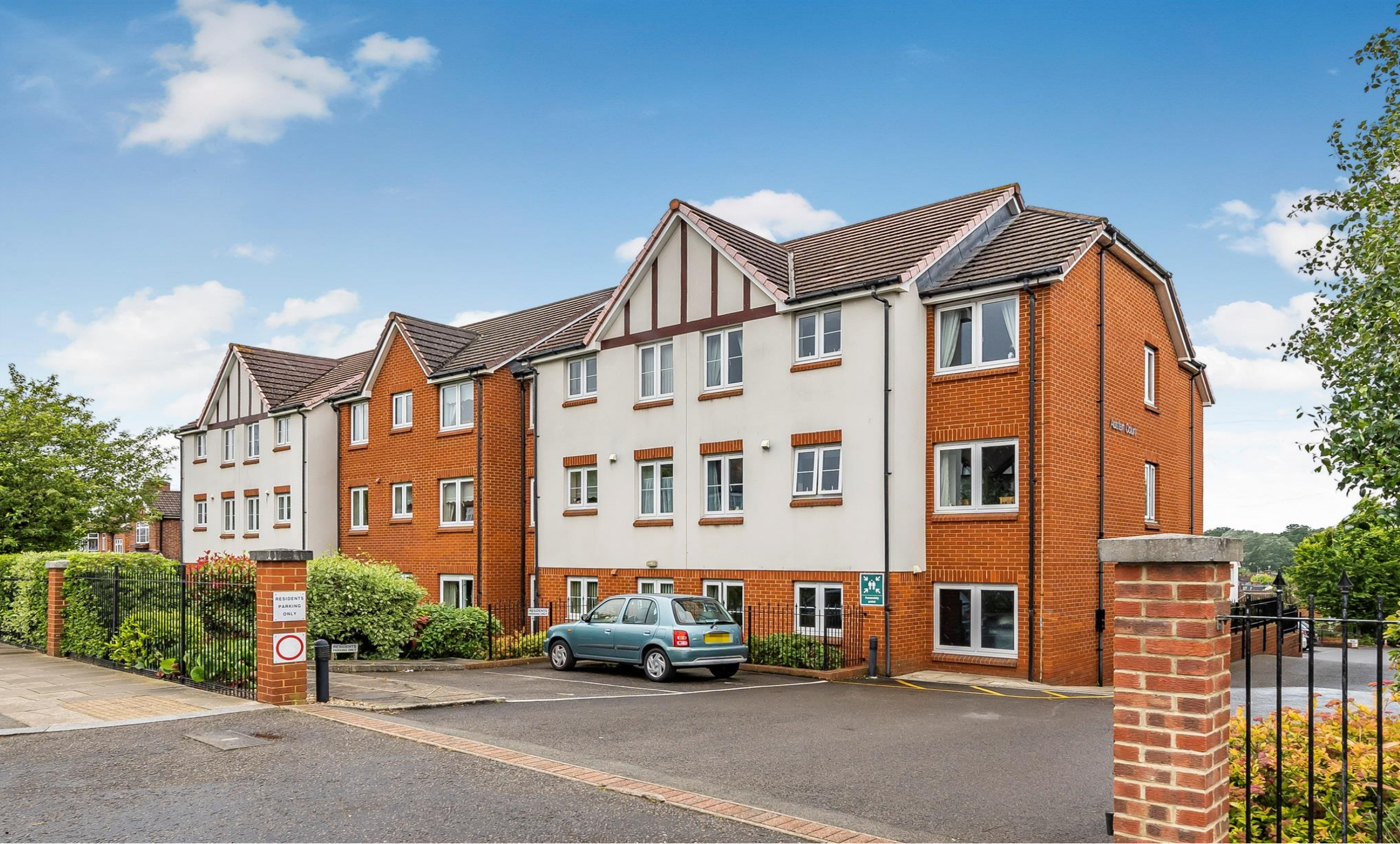
Austen Court, Winchmore Hill Road, London, N21 1QN