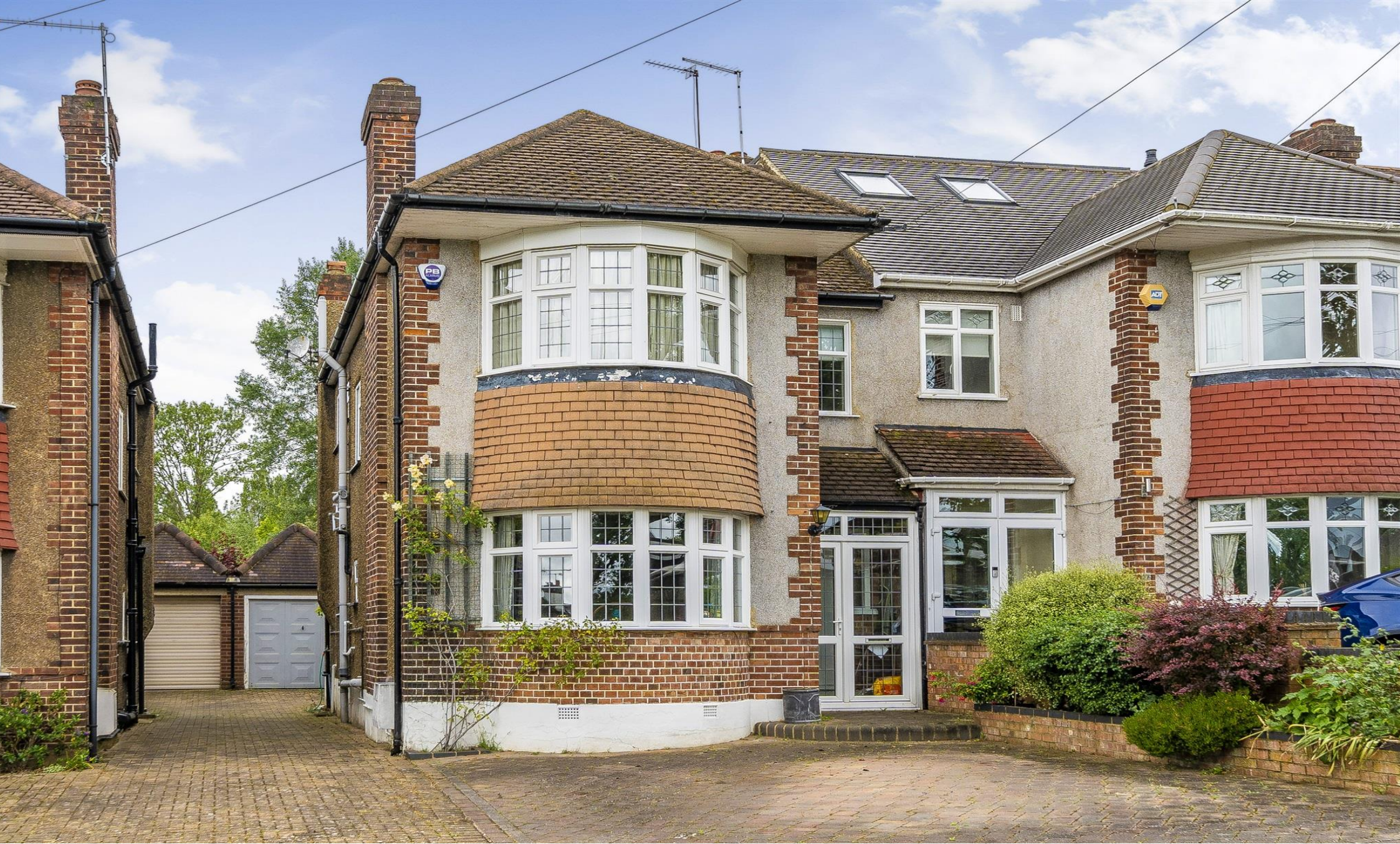
Oakwood Crescent, London, N21 1PA