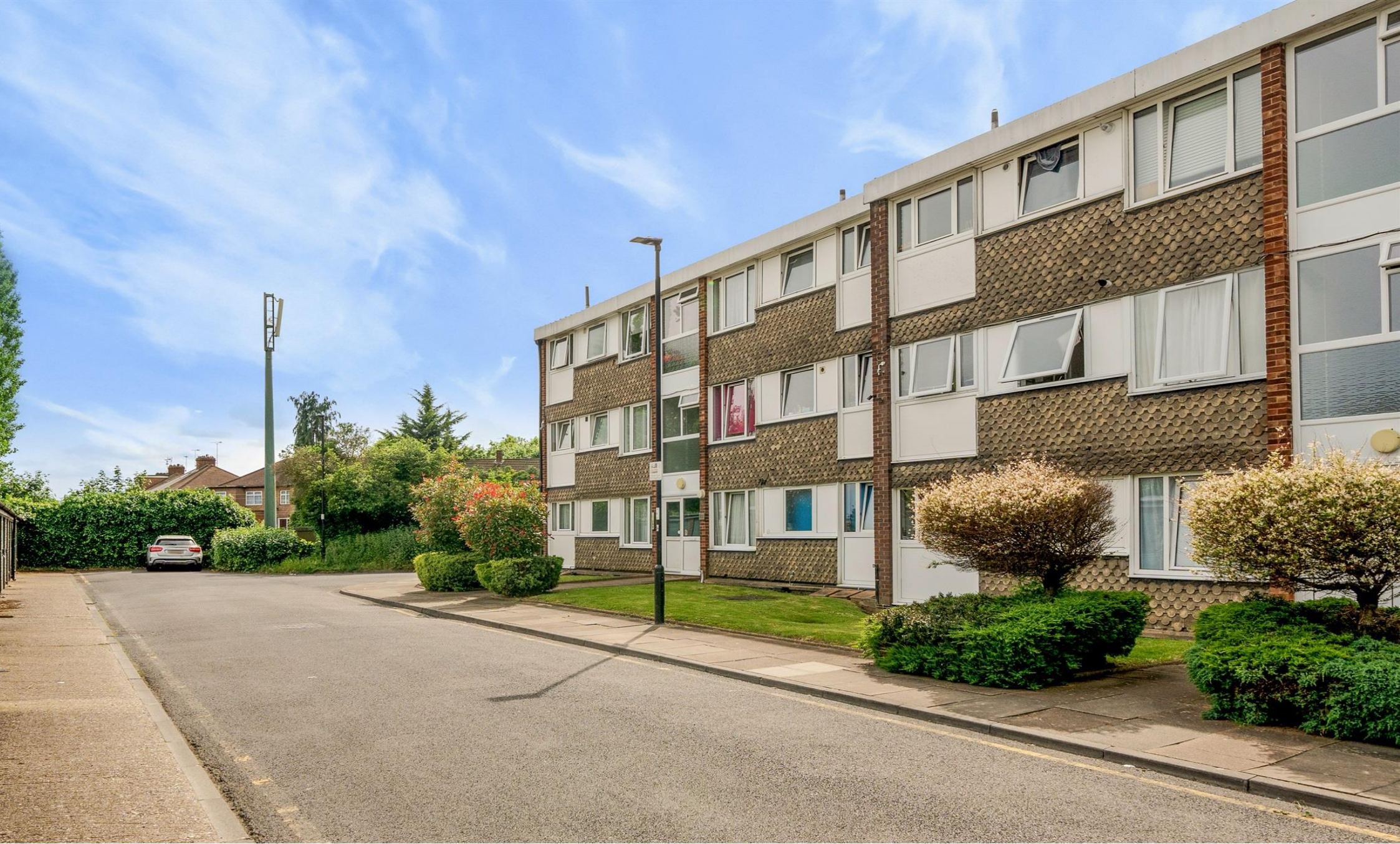
Ingram Court, Wendy Close, Enfield, EN1 1HR