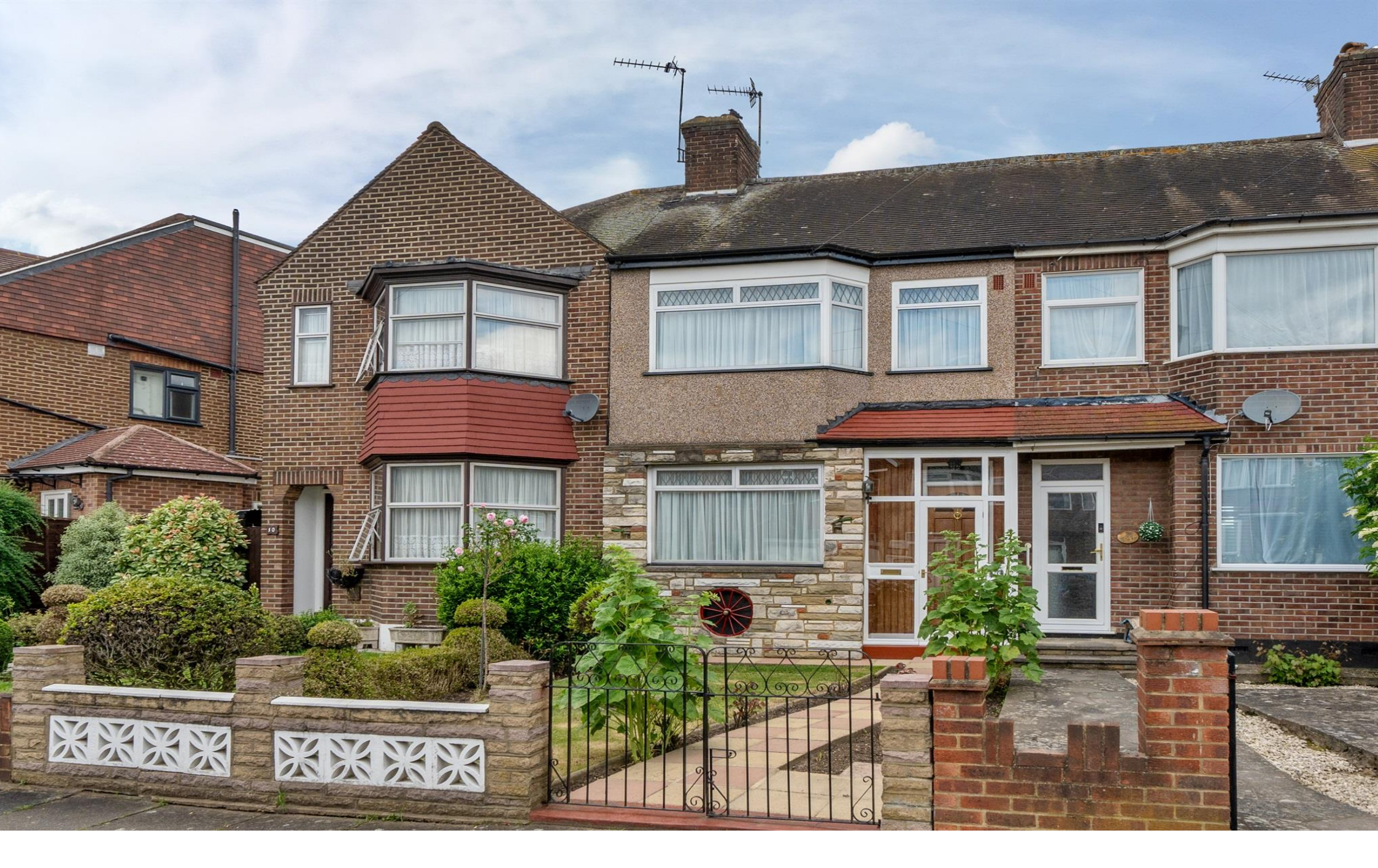
Exeter Road, Enfield, EN3 7TN