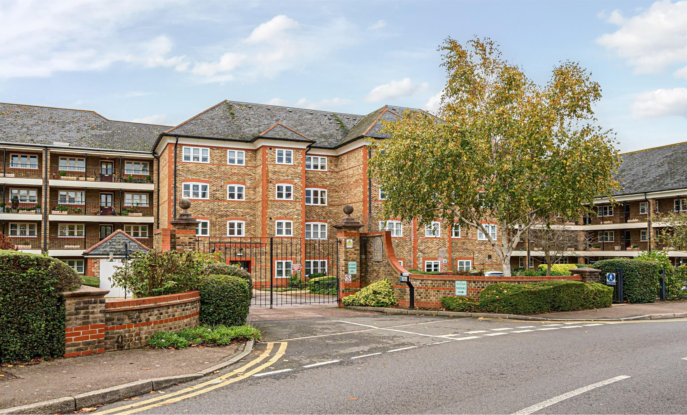
Blake Court, Newsholme Drive, London, N21 1SQ