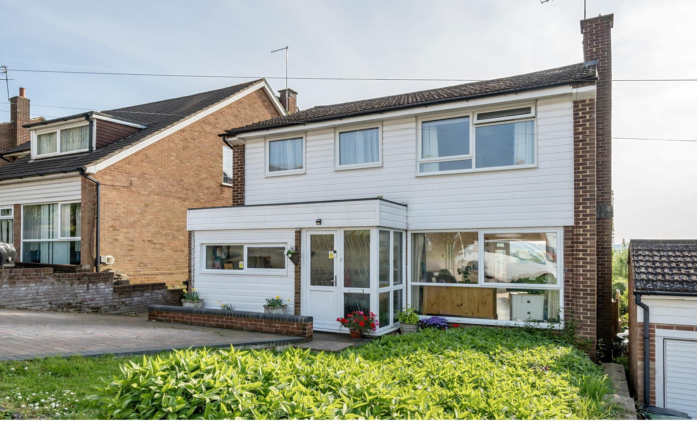
Chase Ridings, Enfield, EN2 7QE