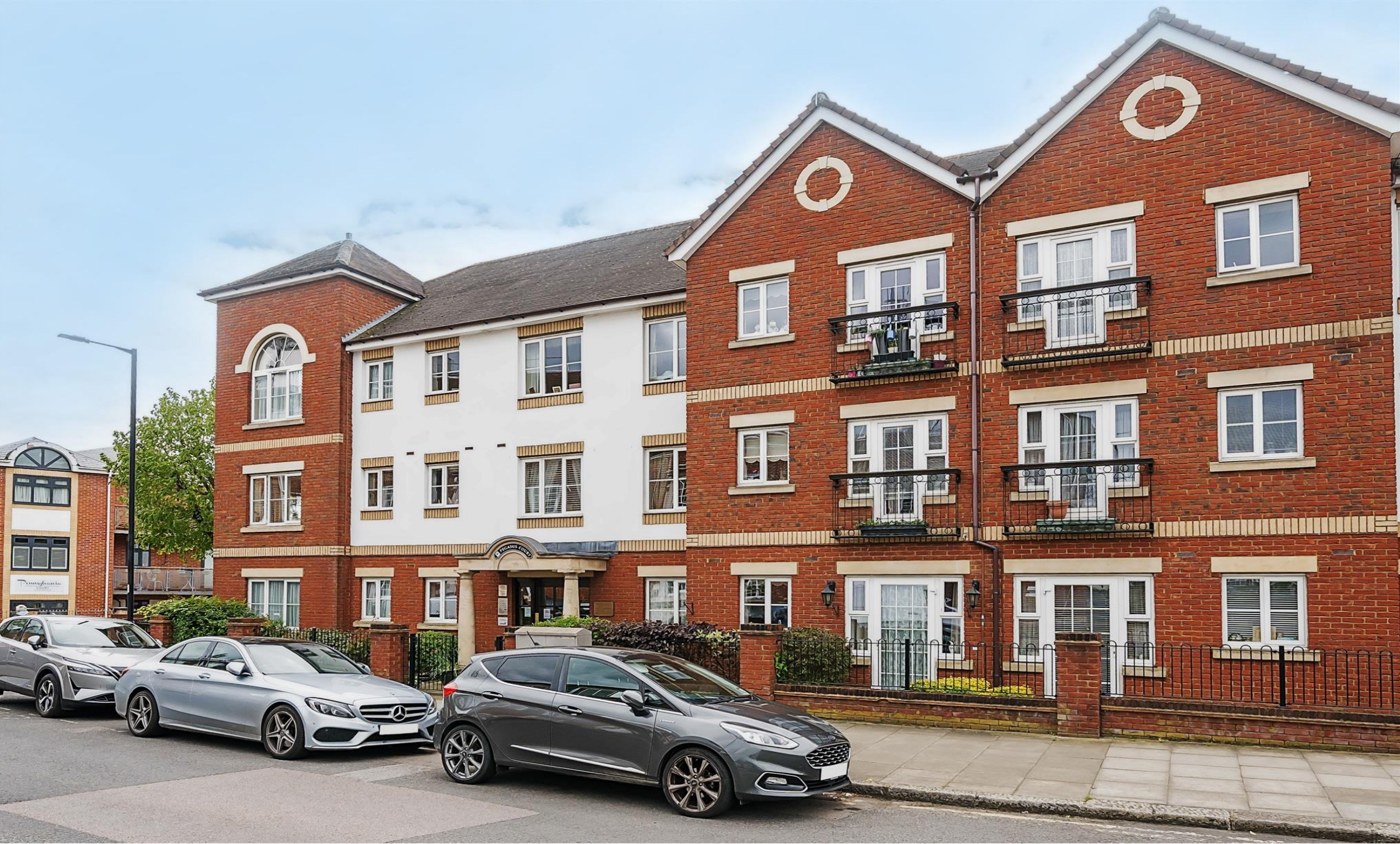
Pegasus Court, Green Lanes, London, N21 2RW