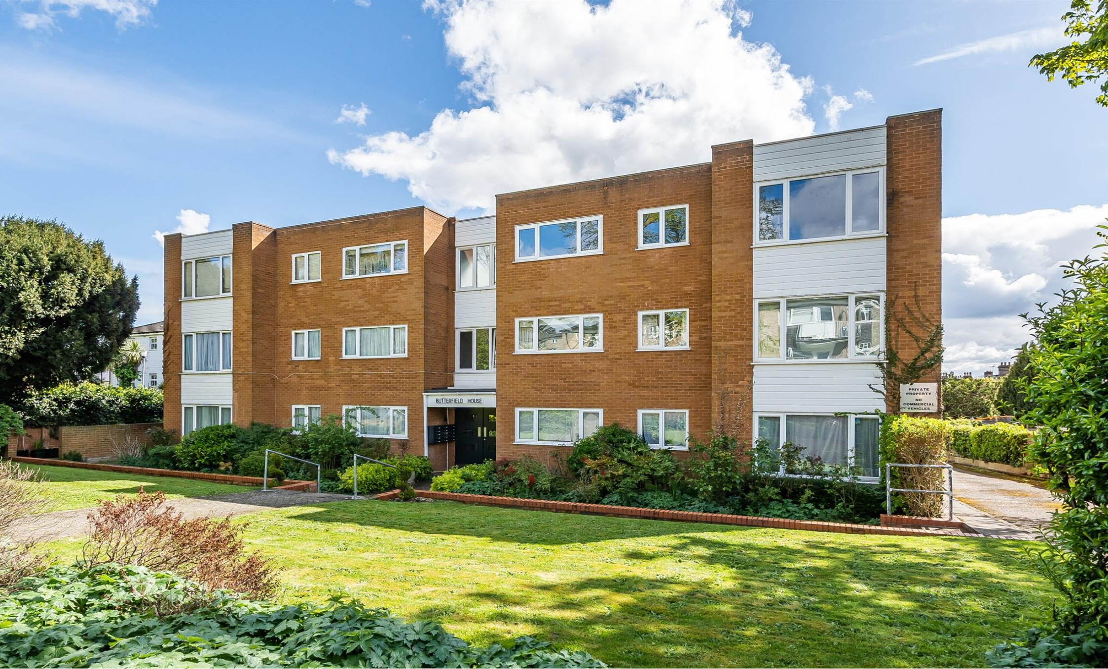
Butterfield House, Bycullah Road, Enfield, EN2 8EZ