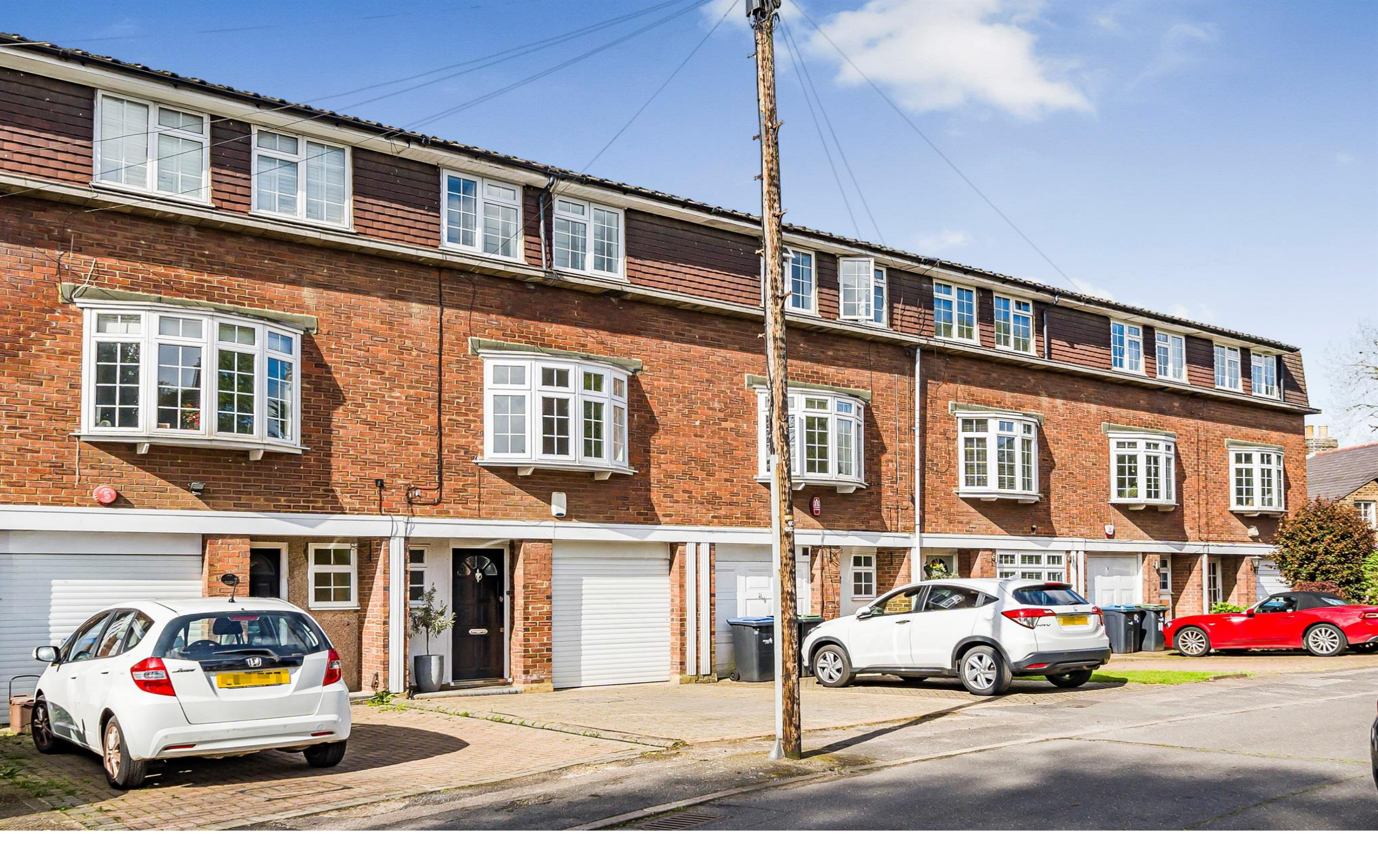
Taunton Drive, Enfield, EN2 7EA