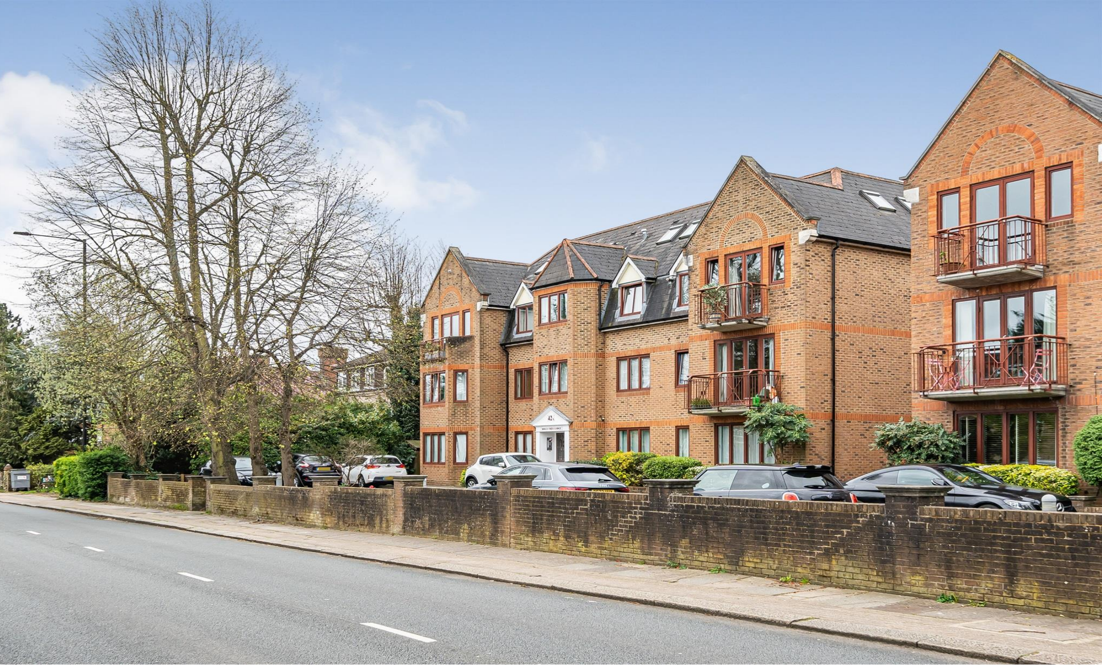
Holly Tree Lodge, The Ridgeway, Enfield, EN2 8QT