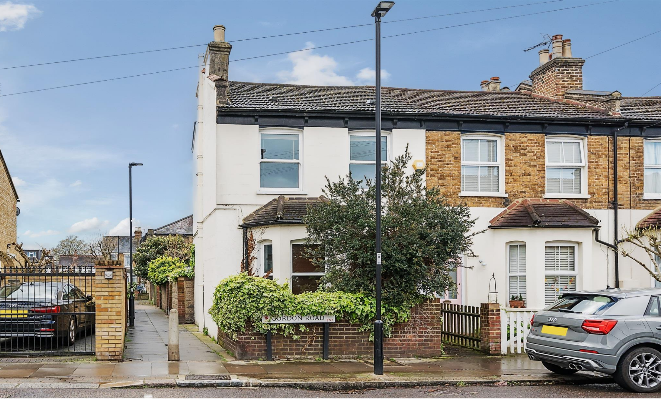
Gordon Road, Enfield, EN2 0PY