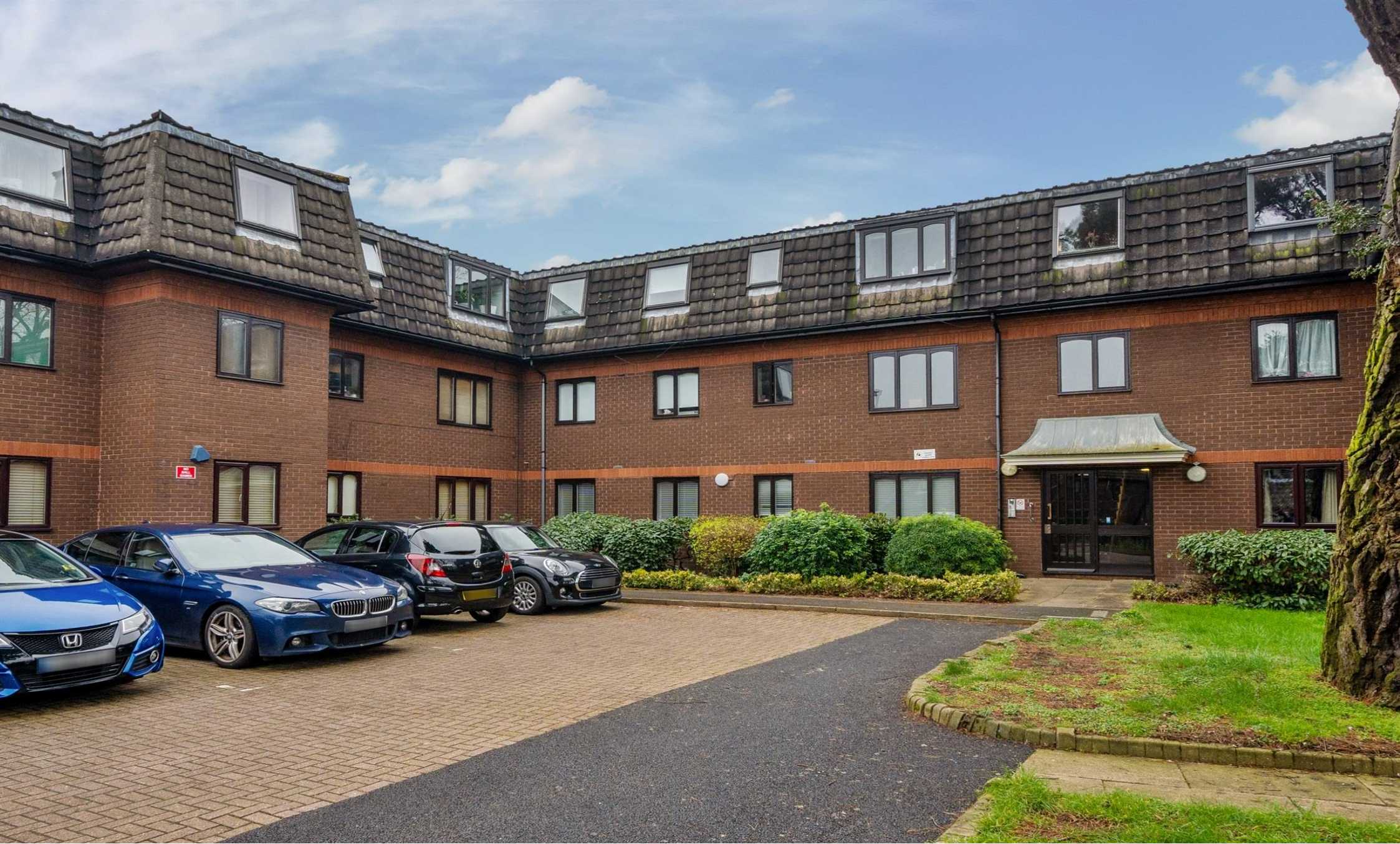
Woodridge Close, Enfield, EN2 8HJ