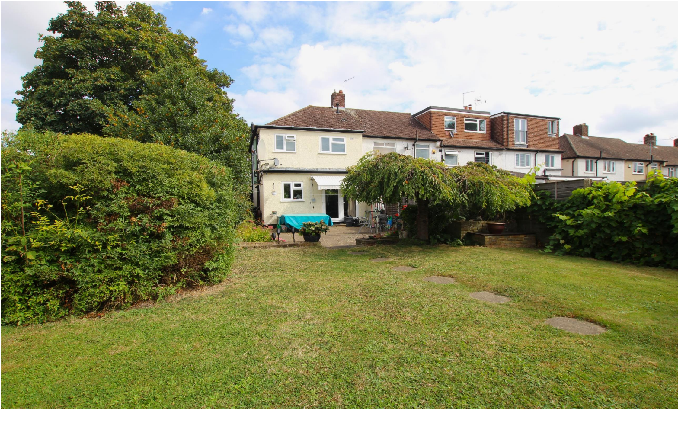
Kenilworth Crescent, Enfield, EN1 3RG