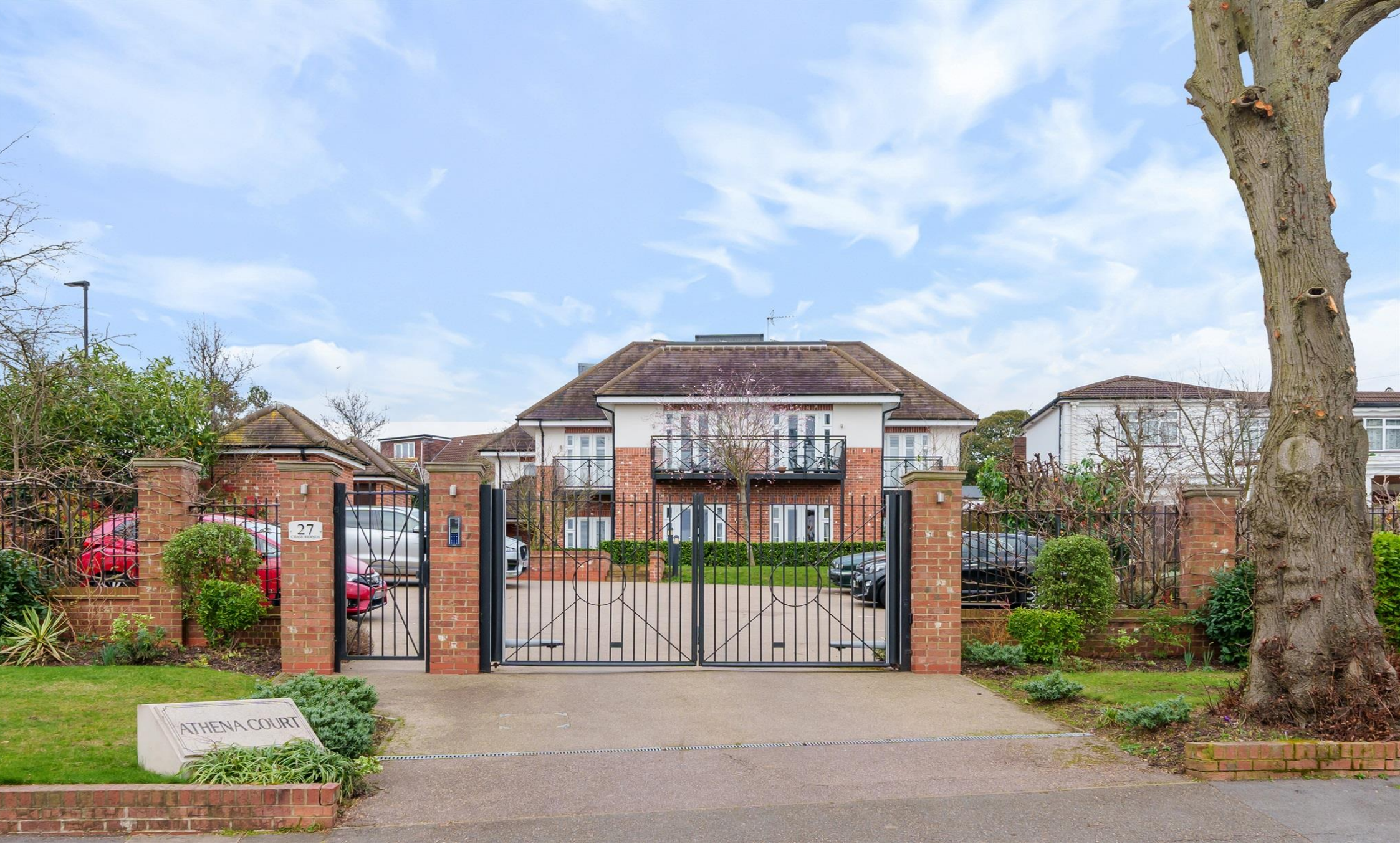
Athena Court, Chase Ridings, Enfield, EN2 7QQ