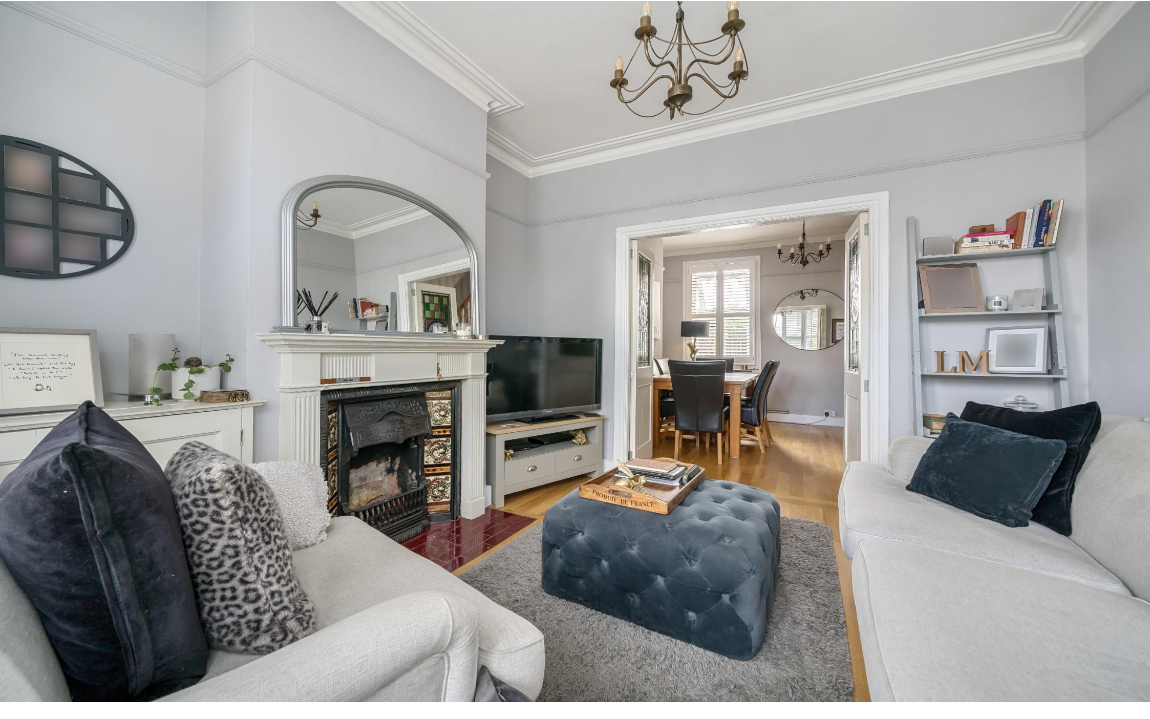
Parsonage Lane, Enfield, EN2 0AL