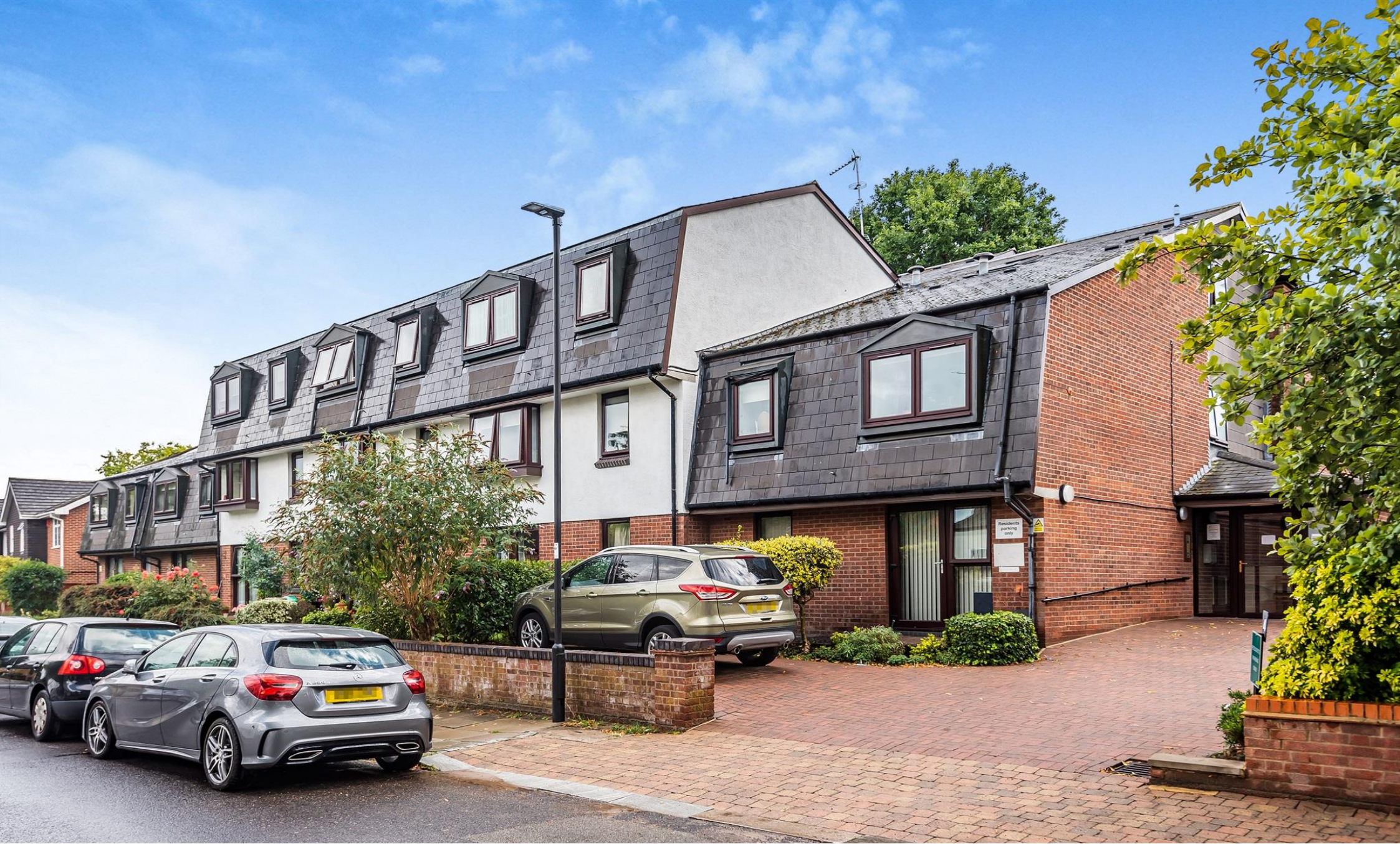
Oakdene House, Bycullah Road, Enfield, EN2 8HB