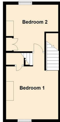
First Floor Approx. 25.9 sq. metres (279.3 sq. feet)