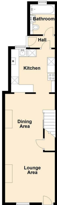
Ground Floor Approx. 40.6 sq. metres (437.5 sq. feet)