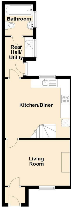
Ground Floor Approx. 35.1 sq. metres (377.6 sq. feet)