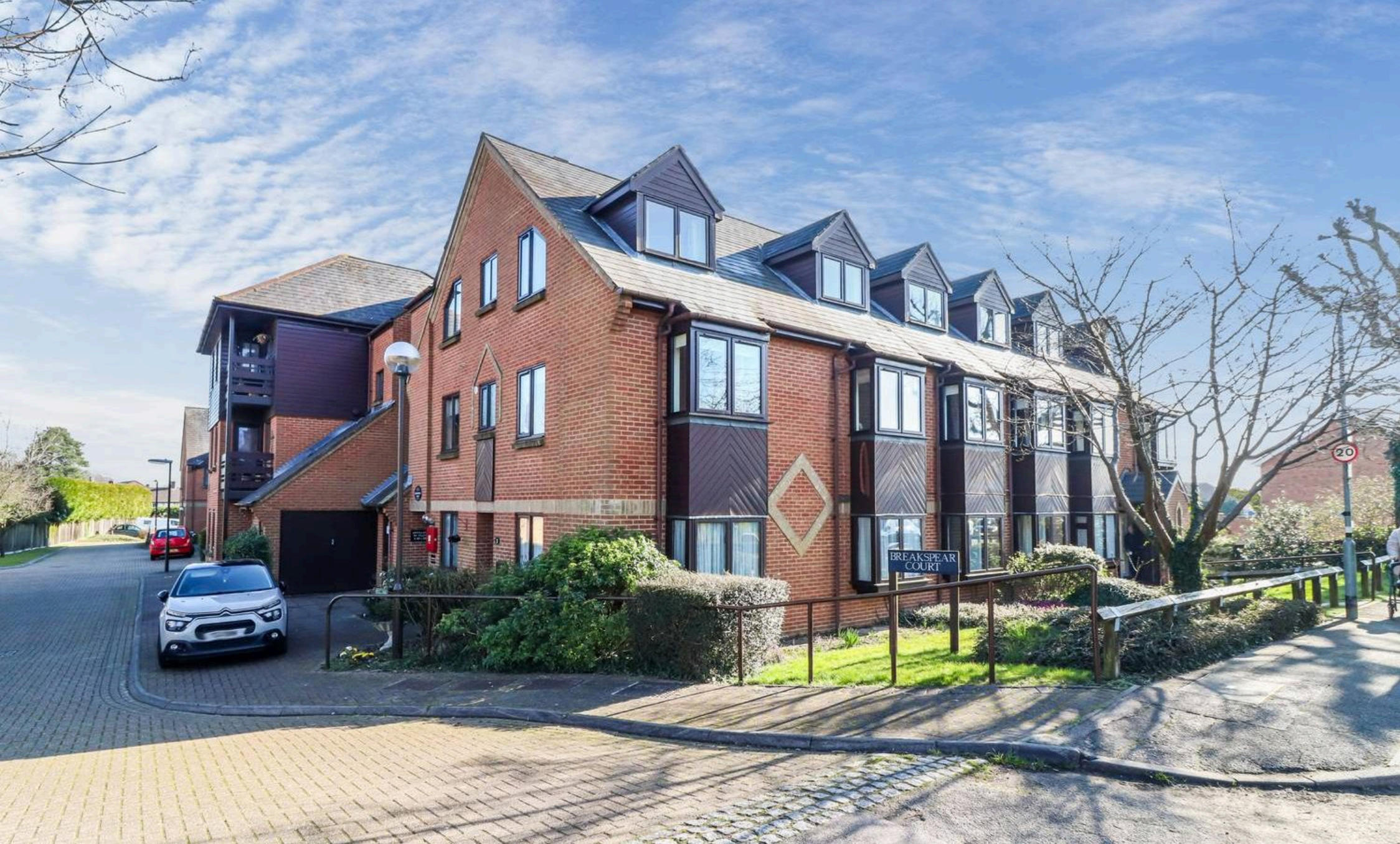
Breakspear Court, The Crescent, Abbots Langley £140,000