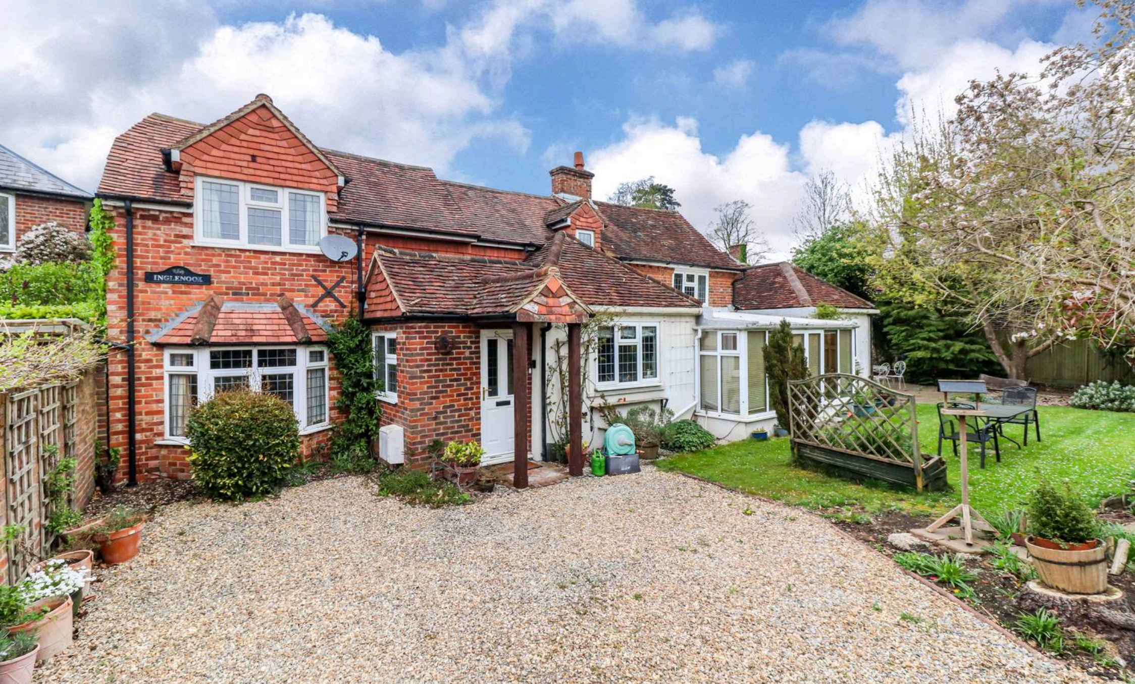
Inglenook The Common, Chipperfield £875,000