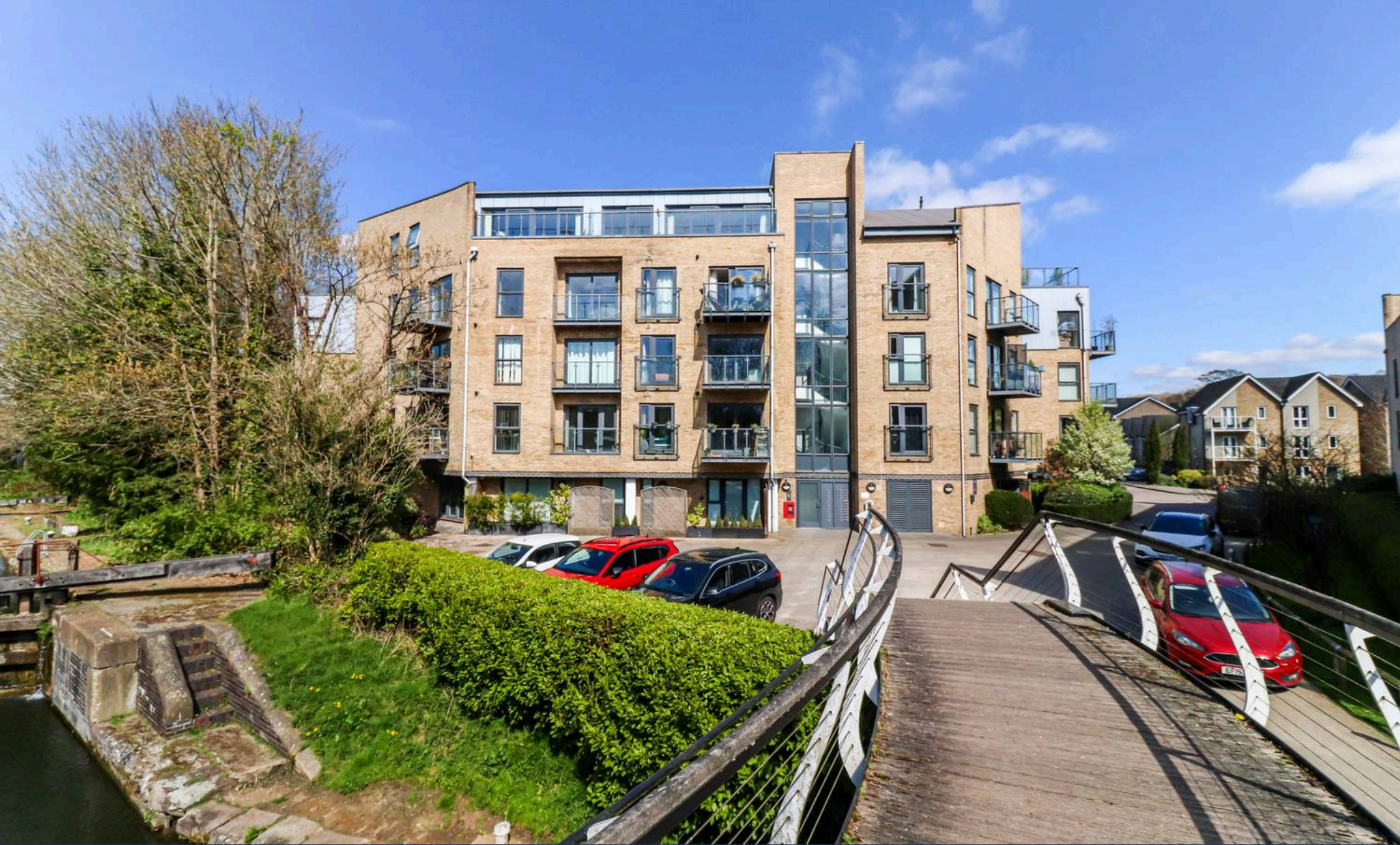
Dickinson House, The Embankment, Nash Mills Wharf £365,000