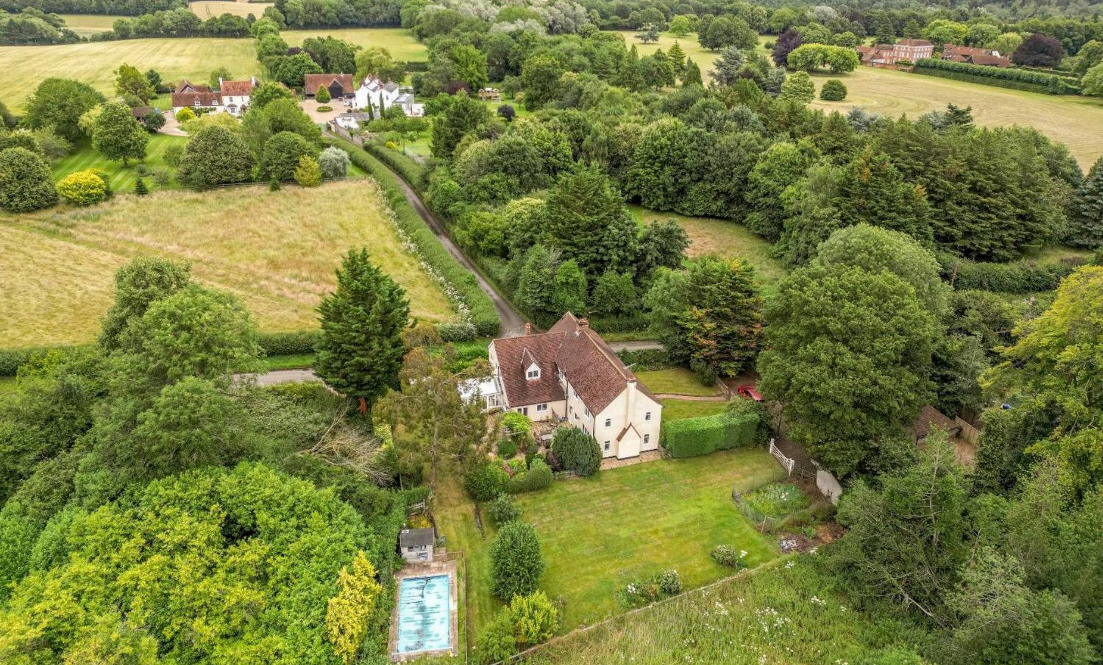
Bucks Hill Cottage Bucks Hill, Kings Langley £1,300,000