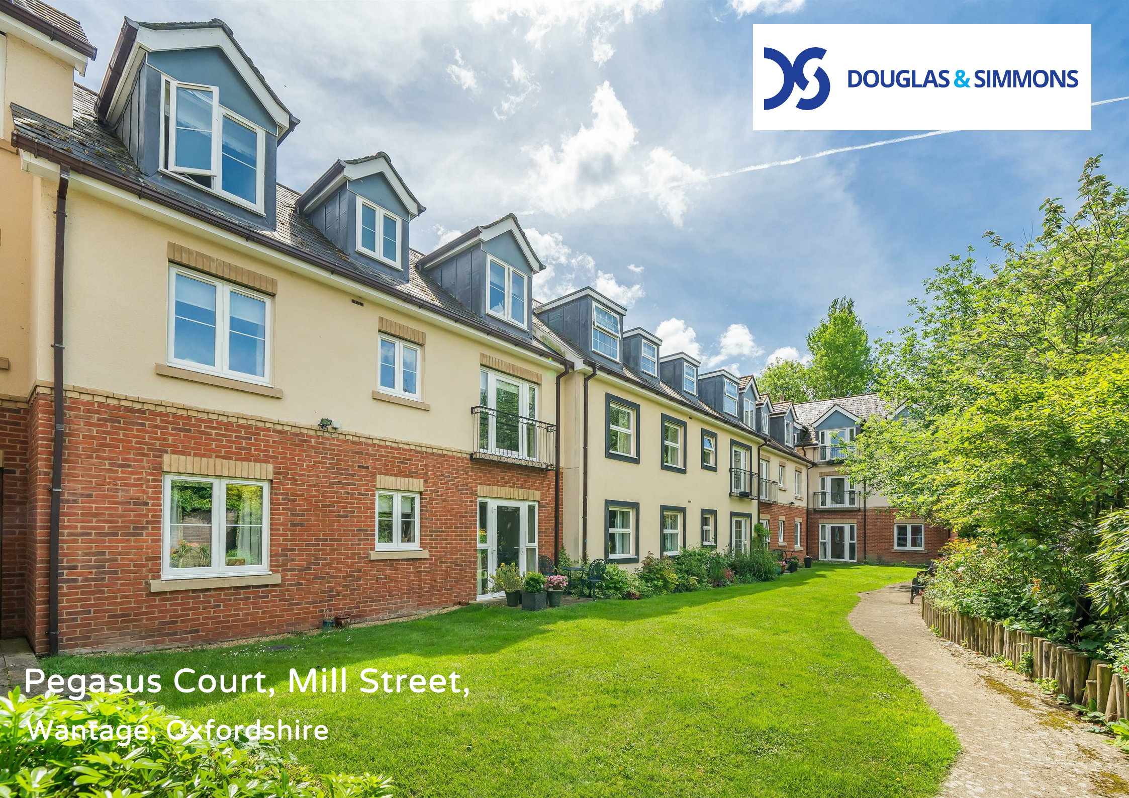
Pegasus Court, Mill Street, Wantage, Oxfordshire