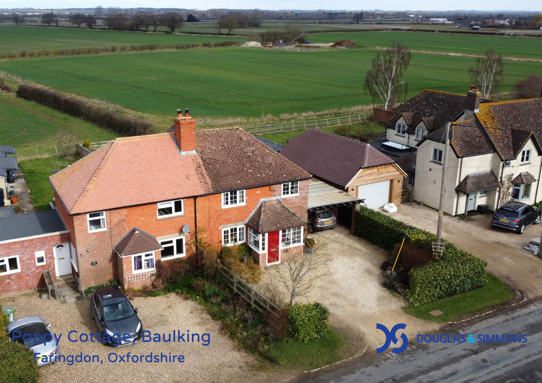
Poppy Cottage, Baulking Faringdon, Oxfordshire