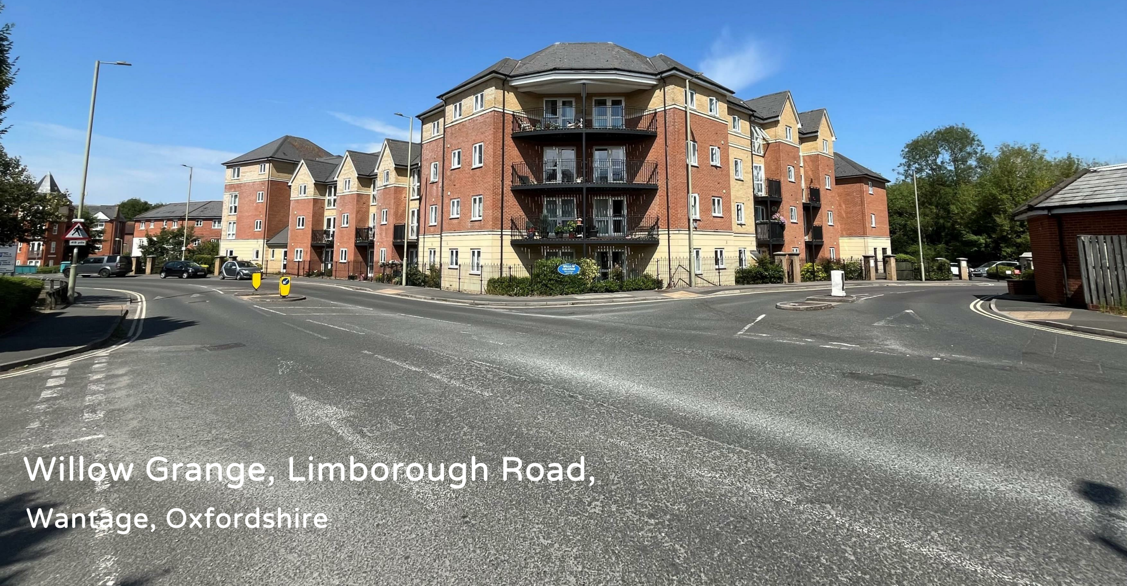
Willow Grange, Limborough Road, Wantage, Oxfordshire