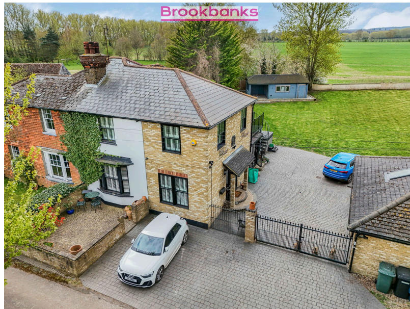
Baldwins Cottages, Hulberry, DA4