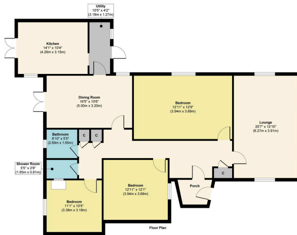
Approx. Gross Internal Floor Area 1498 sq. ft / 139.16 sq. m Illustration for identification purposes only, measurements are approximate, not to scale. Produced by Elements Property