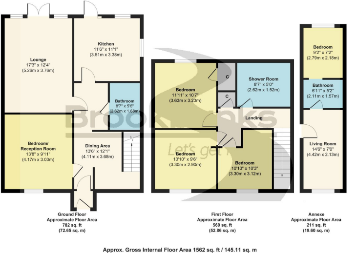
Approx. Gross Internal Floor Area 1562 sq. ft / 145.11 sq. r Illustration for identification purposes only, measurements are approximate, not to scale. Produced by Elements Procerty

This exquisite chalet bungalow offers unparalleled versatility, perfect as a 3, 4, or even 5-bedroom residence. Beautifully maintained and in a prime location, the property features a grand entrance hall, a large lounge, a versatile fourth bedroom/ office, a stunning kitchen, and a ground floor bathroom. The first floor includes three bedrooms with rear views of fields and a family shower room. Additionally, the home boasts a self-contained 1-bedroom annexe, ideal for an office, elderly relative, or teenager's pad. The private, large, and well-maintained garden complements the spacious driveway, providing ample parking. This property offers endless possibilities and is ideal for a large family or those needing flexible living arrangements.