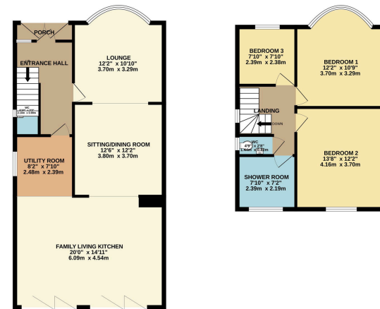
TOTAL FLOOR AREA: 1373 sq.ft. (126.2 sq.m.) approx.

While every attempt has been made to ensure the accuracy of the floor plan, measurements, dimensions, contents and floor levels shown are approximate and are not intended to be used for legal purposes. The purchaser should verify all dimensions and measurements shown. The floor plan is not a guarantee of any kind. It is not a contract and should not be used as such. It is not a guarantee of any kind. It is not a contract and should not be used as such. It is not a guarantee of any kind. It is not a contract and should not be used as such.