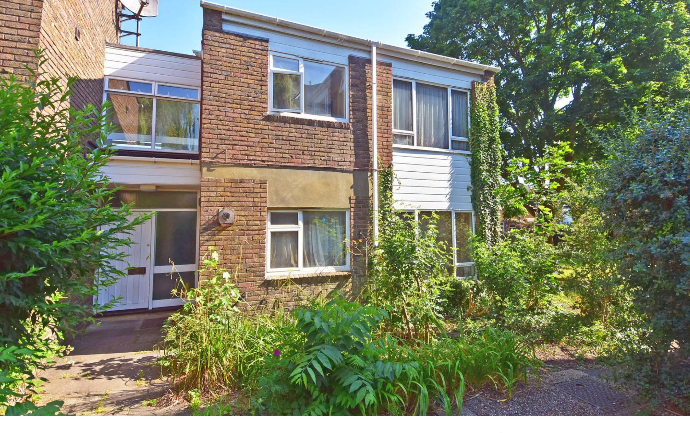
15 Beard Road, Kingston Upon Thames £270,000