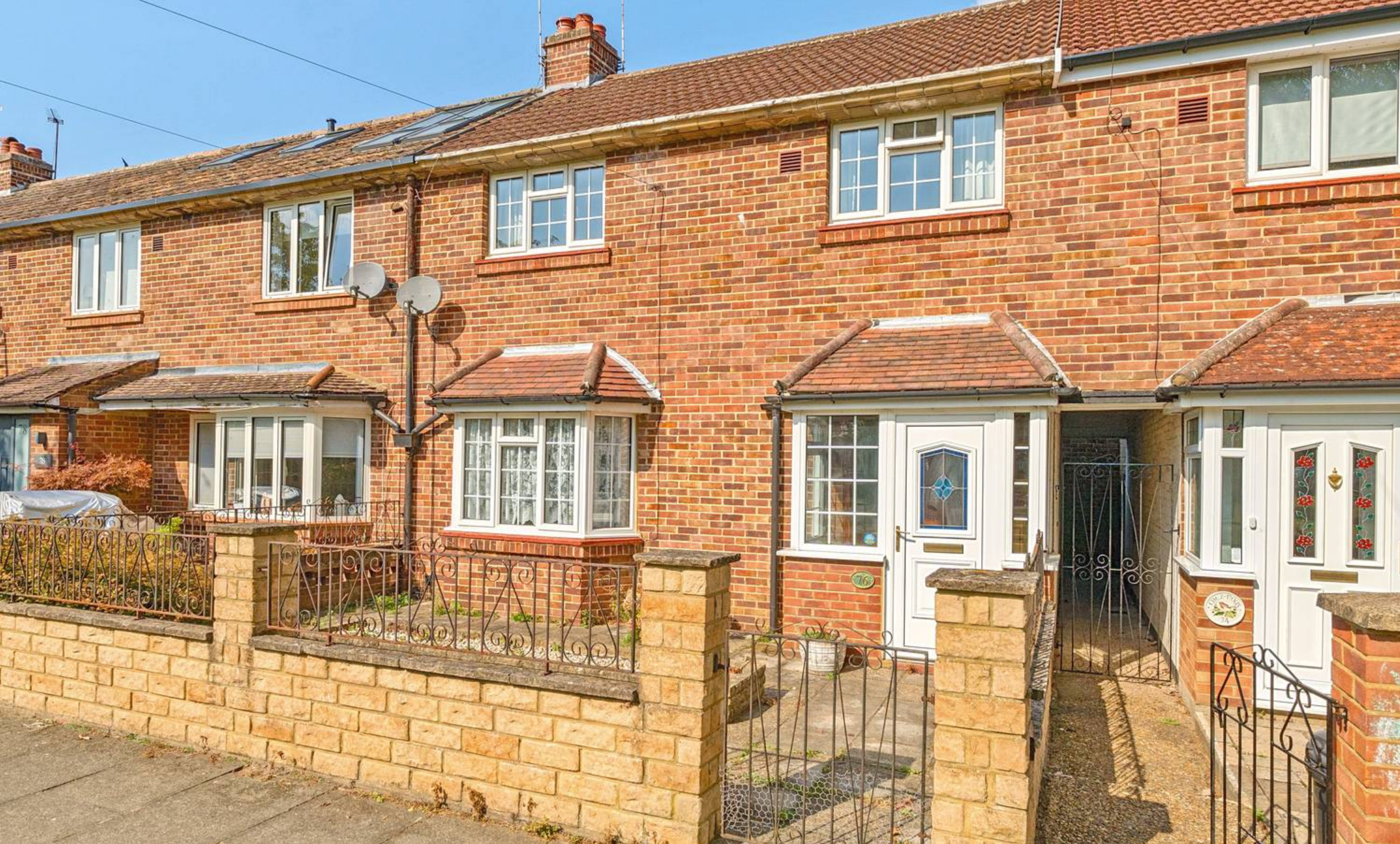
76 Buckingham Road, Richmond £735,500