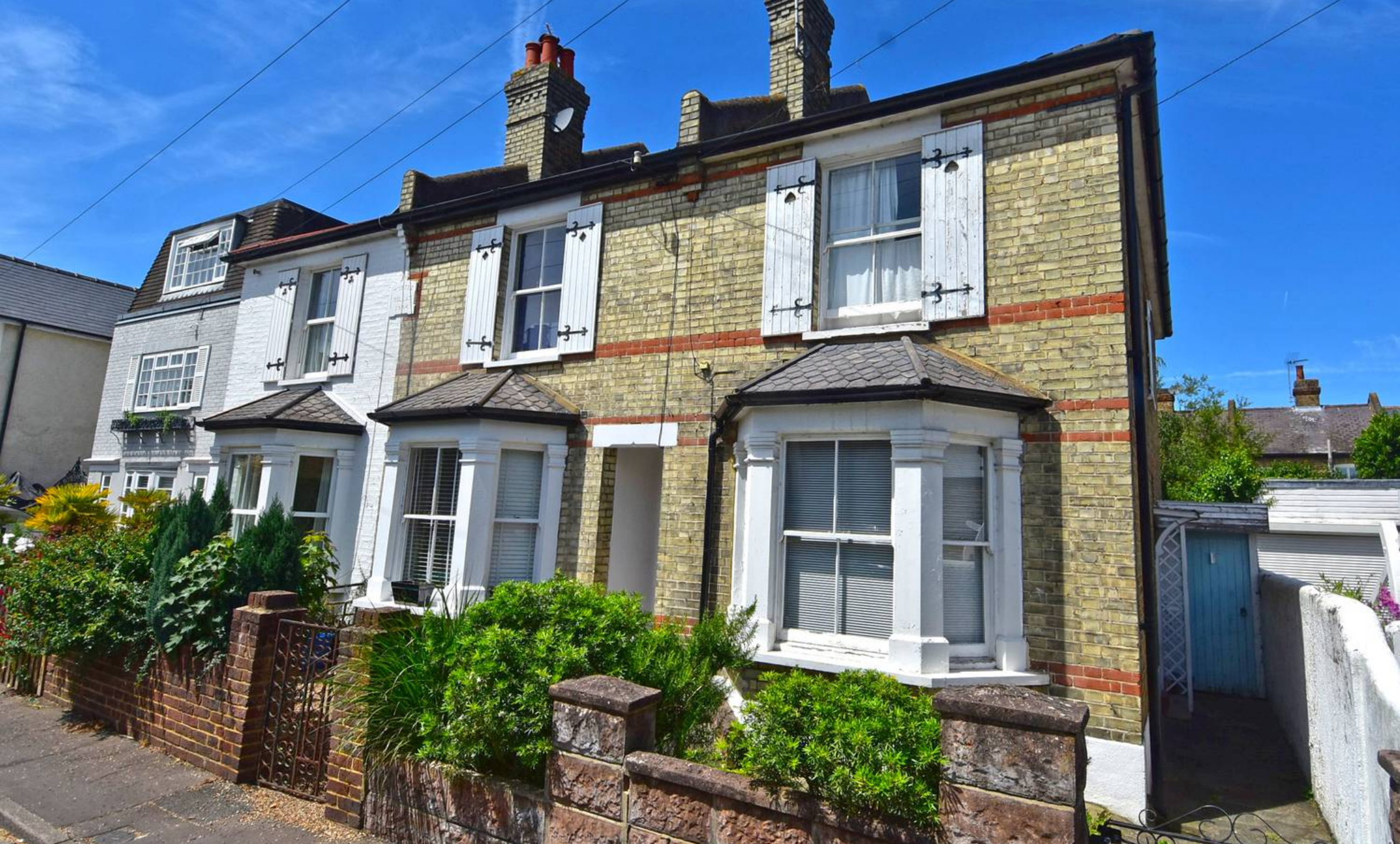
12 New Road, Richmond £799,950