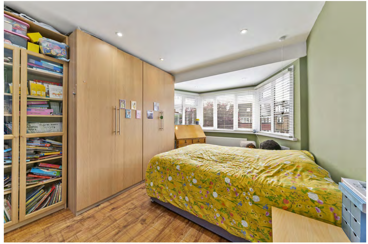
<u>REAR BEDROOM</u> : Abt. 13 ft 1 x 10 ft 4 (3.98m x 3.14m) Double glazed half bay to rear garden aspect, laminate flooring, radiator, spotlighting.