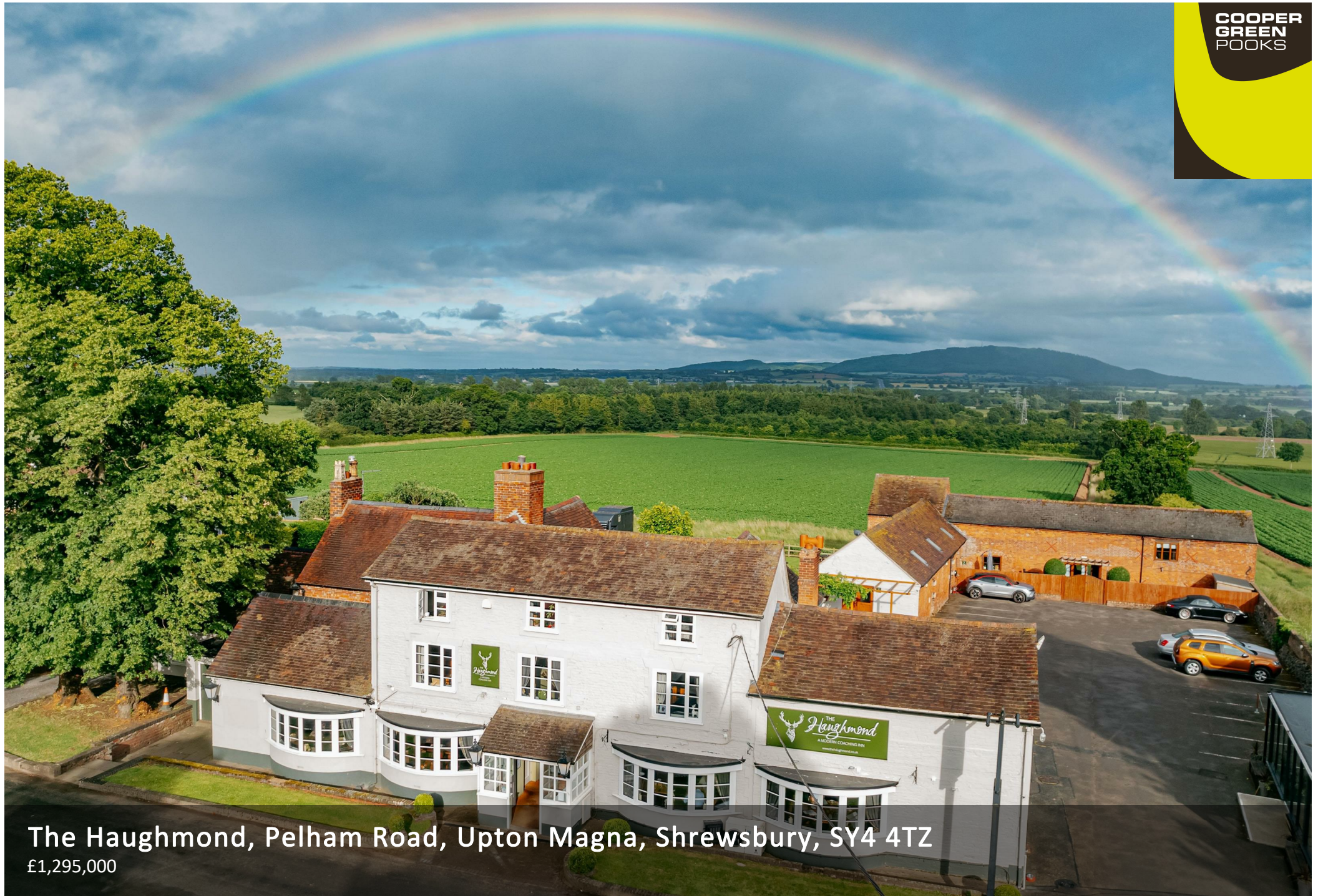
The Haughmond, Pelham Road, Upton Magna, Shrewsbury, SY4 4TZ £1,295,000